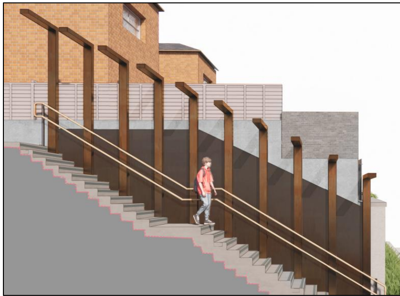
Illustration is indicative

We will need to remove existing concrete to put in these 10 steel support frames and then we will pour fresh concrete in place to secure them in phases. Additional concrete will then be poured for the stairs, before the handrails are installed.