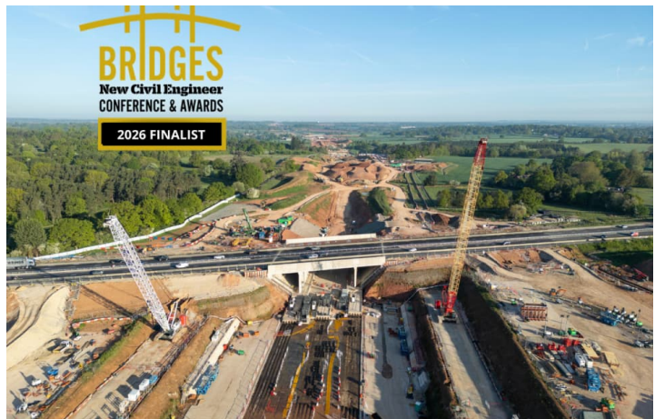
A46 Kenilworth Bypass Overbridge for NCE Bridges Award