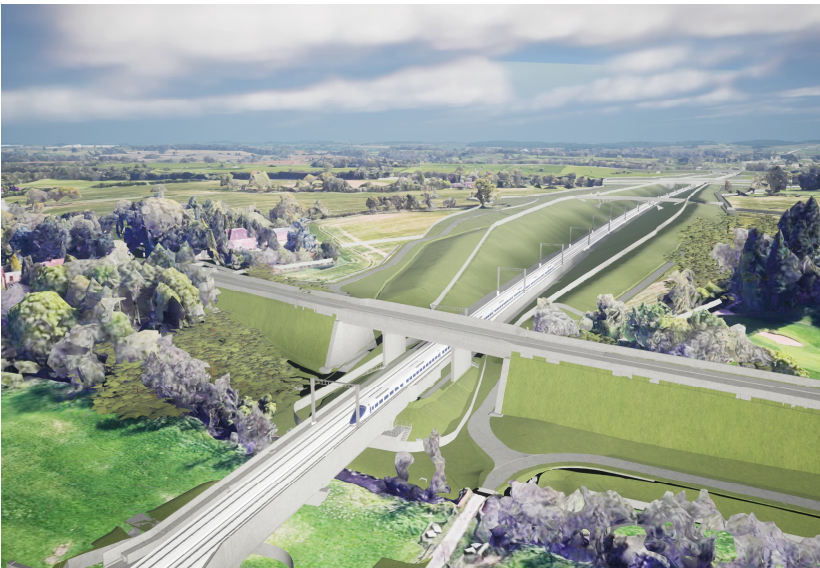
Dalehouse Lane artist illustration

The timing of the work has enabled us to complete the A46 and reduce future impacts on local traffic. The closure period will include one Christmas period, and work is being carefully coordinated to manage impacts as much as possible.