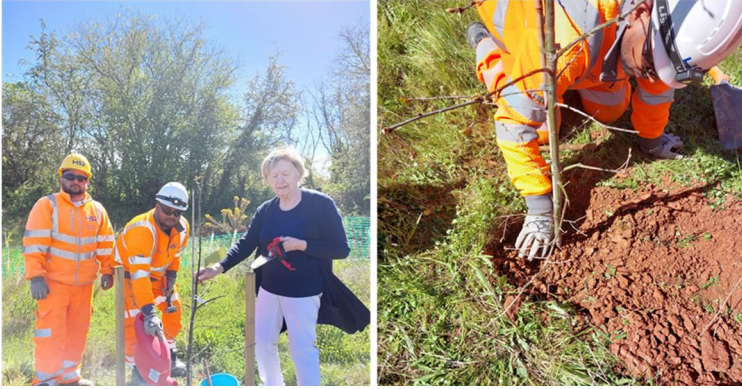
BBV volunteers planting at Burton Green Village Hall

Burton Green Residents Association approached BBV for support with the planting of an oak tree at the new Burton Green Village Hall. The tree was planted in memory of the late Queen Elizabeth II's final Jubilee and to commemorate two of the village's longest-standing residents.