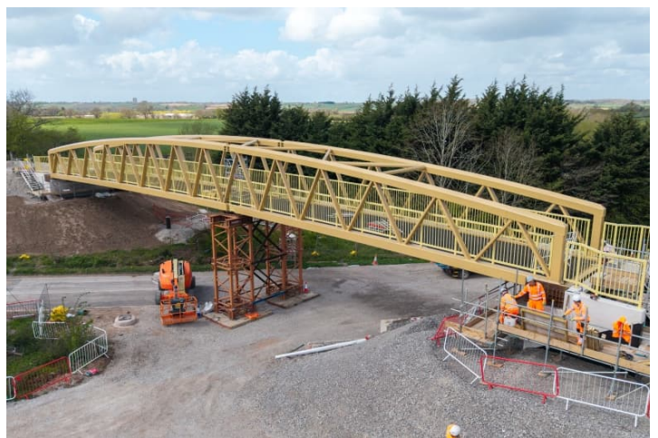
Fosse Way cycle bridge

Works are continuing, including connecting existing footpaths and cycle routes, as well as surfacing, landscaping and fencing, ahead of the bridge opening to the community in Summer 2026.