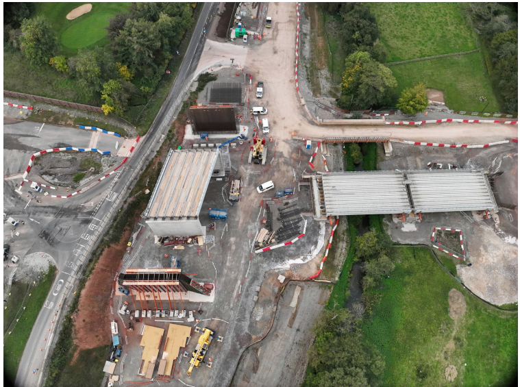
Dalehouse Lane aerial image

completion of structural elements such as abutment wingwalls. The programme also involves bringing in specialist plant and materials, along with significant utility works. Multiple utilities will need to be diverted over the new bridge, while redundant utilities on either side of the works will be removed before new infrastructure is installed.