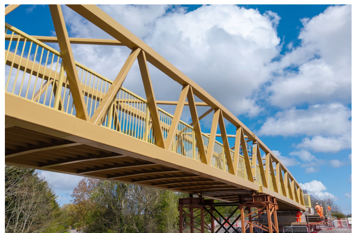
Fosse Way cycle bridge