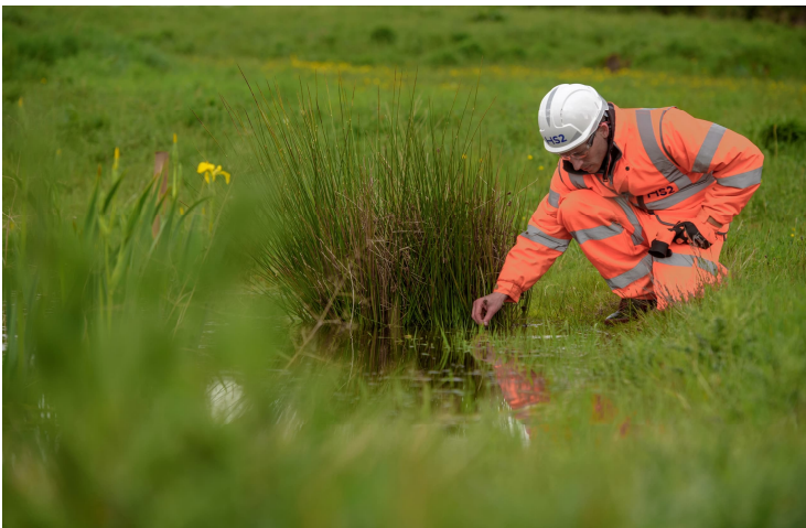
Planting at HS2's ecology site

Planting in South Warwickshire is currently expected to take place during the 2027/28 and 2028/29 planting seasons, subject to suitable ground conditions and ongoing preparation. Planting seasons typically run from November to March, when trees and shrubs are dormant and have the best chance to establish successfully.