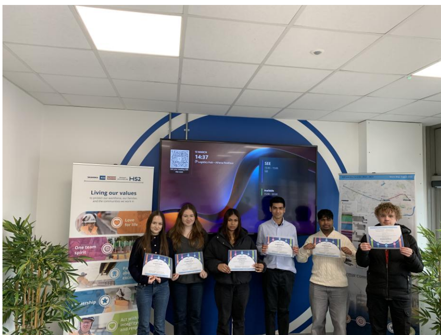
St Dominic's pupils receiving their certificates after the end of program presentations

The week ended in the pupils delivering a presentation to SCS team members, reflecting on their experience and sharing what they had learned during their time on the project. The students spoke openly about what had gone well, the challenges they faced and the key lessons they would take forward into their future education and careers.