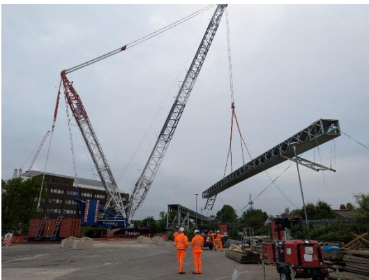
Conveyor bridge lift from the Flat Iron site

SCS JV would like to thank residents, businesses and road users for their patience and cooperation while the closure was in place. The successful removal of the conveyor bridge reflects the continued progress being made across the Victoria Road worksites, while reducing the amount of temporary construction infrastructure in the local area.