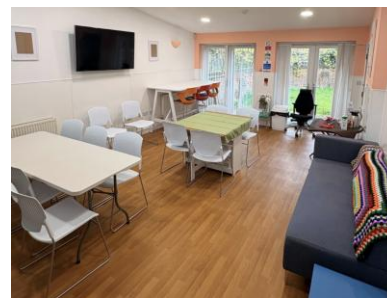
Office furniture finding a new home

If you are a local charity or organisation with a project that could benefit from support, please contact us via the HS2 helpdesk to discuss potential opportunities.