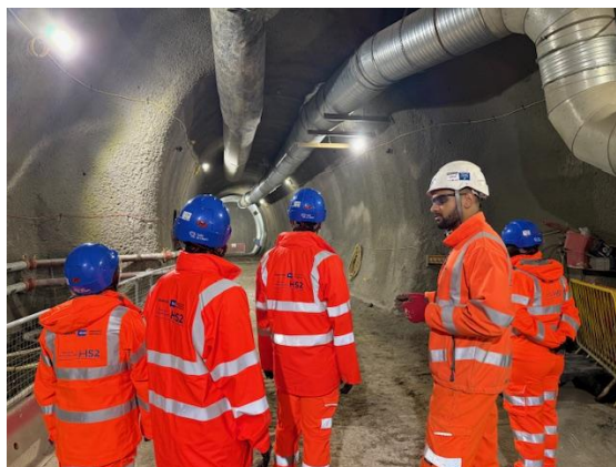
Residents visit the Old Oak Common Tunnel (2025)

Please contact the HS2 helpdesk if you would like to speak about these works.