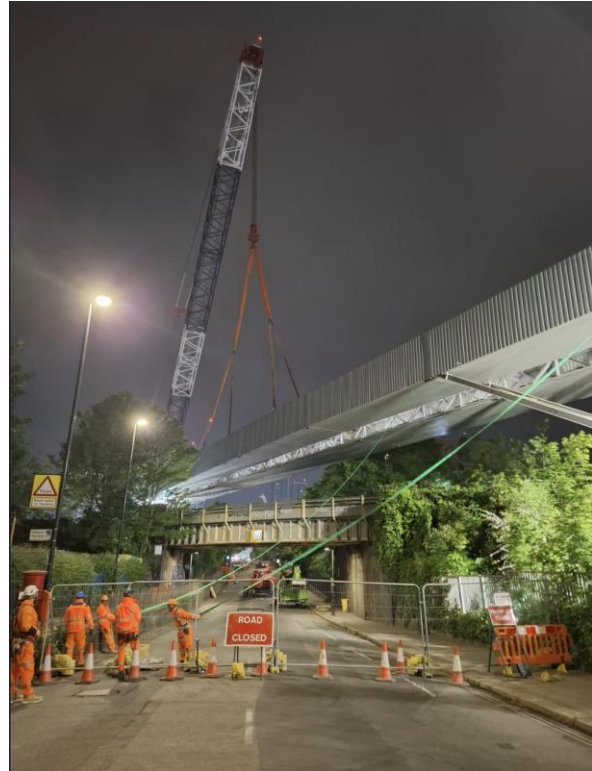
Road closure on Victoria Road during conveyor bridge lift

With the bridge removal works on Victoria Road, SCS provided a taxi shuttle service to help residents move around the area safely and conveniently.