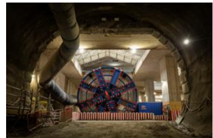
View from the Euston Tunnel

We are preparing for the next stage of the station roof by inspecting key structural steel components. This work will support the construction of a full-scale mock-up section of the roof, enabling engineers to examine the design in detail and ensure its can be built and assembled as planned.