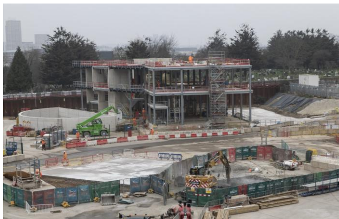
Steel and concrete structure of the VRCB headhouse

The Victoria Road Crossover Box compound is a key structure on the HS2 route. Once complete, it will allow trains to switch between tracks within the tunnelled section of the railway. This is an important operational feature, helping to provide flexibility for the future railway service.