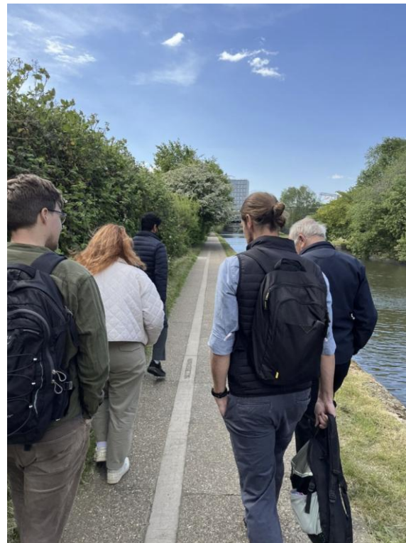
Canal visit with the Canal & River Trust and OPDC

We're looking forward to seeing this part of the Grand Union Canal thrive under the care of BBVS and other businesses who have adopted neighbouring stretches.