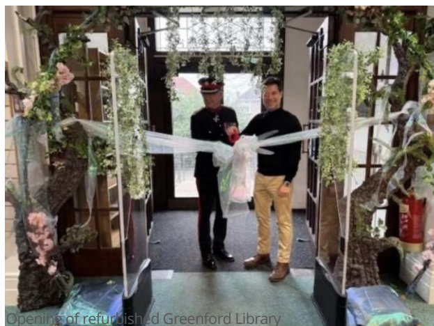
Opening of refurbished Greenford Library

For details of CEF and BLEF funding, follow the link below ( hs2funds.org.uk ) - https://hs2funds.org.uk/