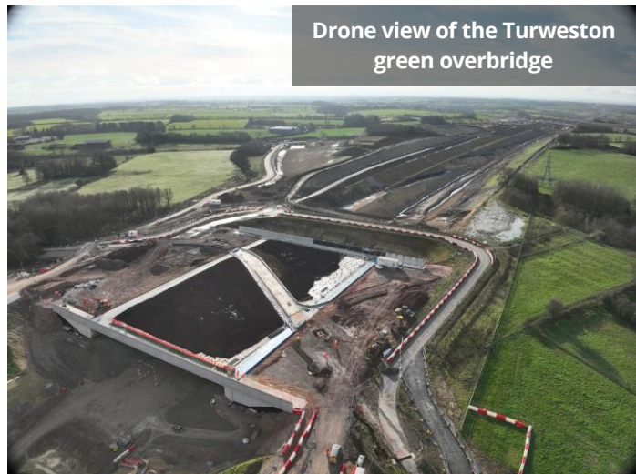
Drone view of the Turweston green overbridge

Throughout the construction, we've maintained access for the local community via a temporary road. Once the bridge and road open, we'll remove the temporary road and continue to excavate the remaining earth in the railway cutting.