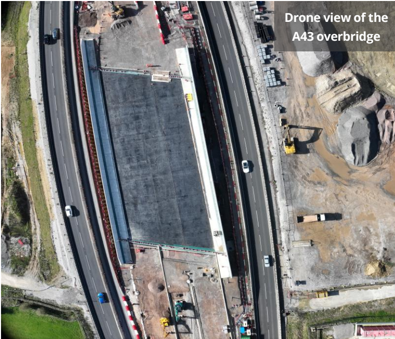
Drone view of the A43 overbridge

To safely complete the next stage of construction, several weekend road closures are scheduled for the summer, following the Silverstone Grand Prix. To minimise disruption, closures will alternate between the northbound and southbound carriageways on different weekends.