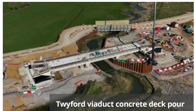
Twyford viaduct concrete deck pour