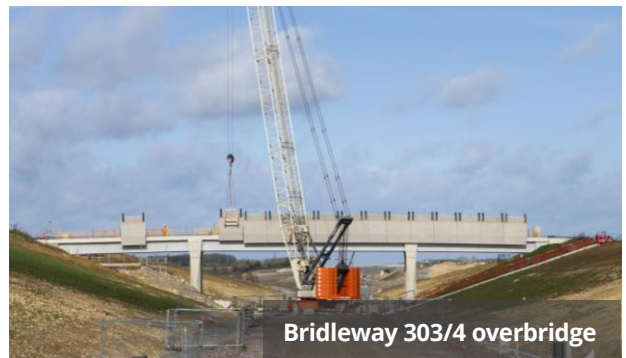
Bridleway 303/4 overbridge