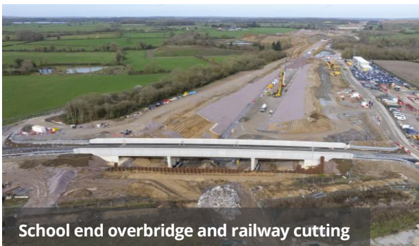
School end overbridge and railway cutting