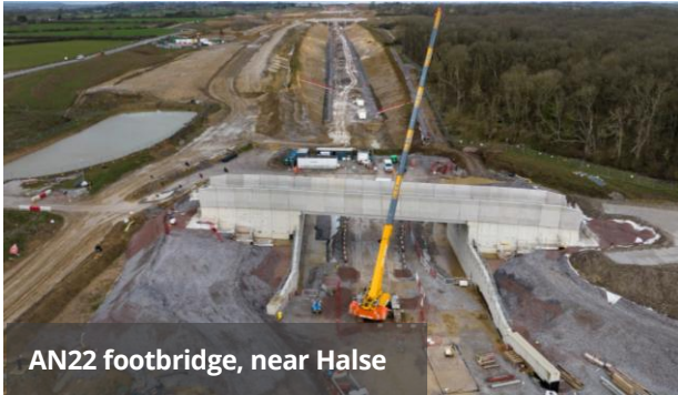
AN22 footbridge, near Halse