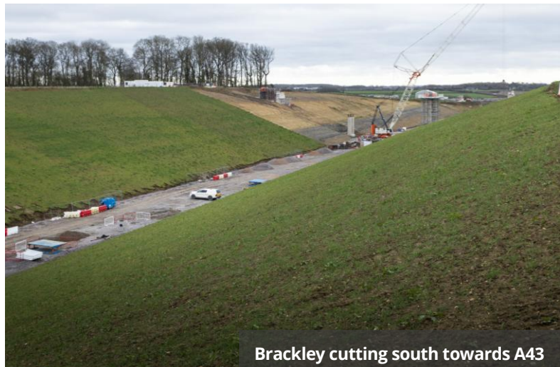
Brackley cutting south towards A43

Once the A43 road realignment is complete and the bridge is open, we will remove the temporary road and finish the earthworks beneath the bridge. Works near the A43 will continue until early 2027, with final utility diversions and connections planned later this year, which may require some overnight closures.