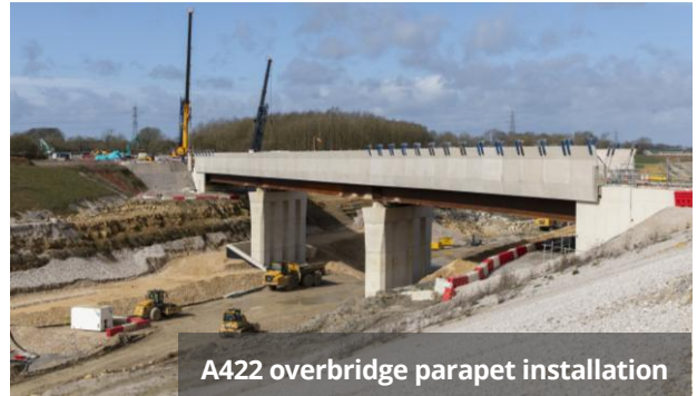
A422 overbridge parapet installation