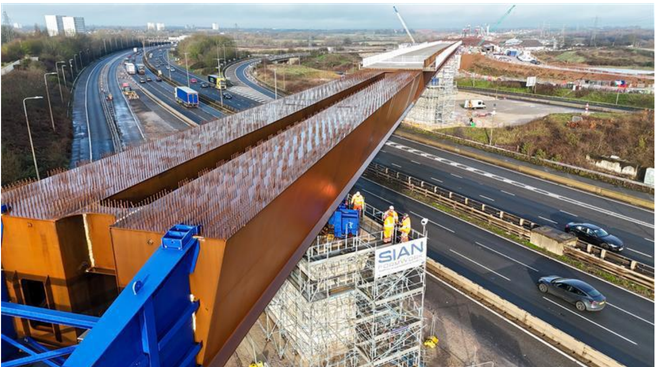
Image of the M6 South viaduct East Deck across the motorway.

The M6 South viaduct will carry the new high-speed railway over the M6 motorway and adjoining slip road, near Birmingham Business Park, Birmingham Airport and the NEC in Solihull. This section of the M6 Motorway is located near Chelmsley Wood, between junction 4 northbound and 4a southbound, as well as the M42 junction 7a northbound.