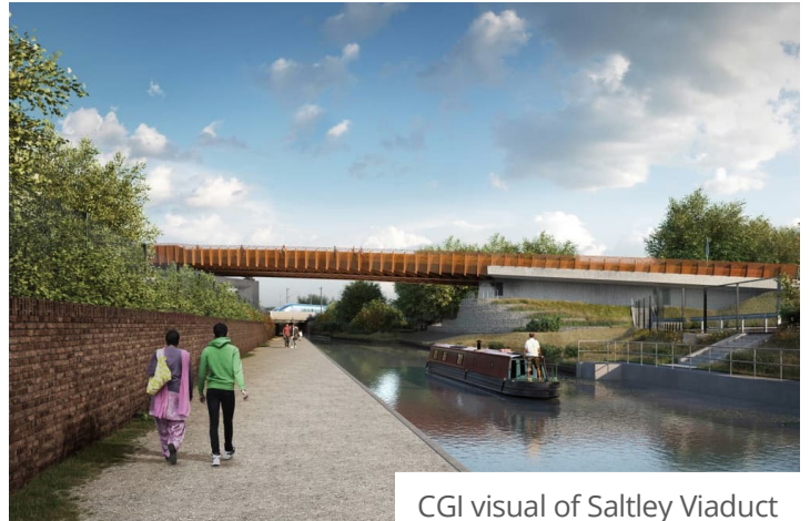
CGI visual of Saltley Viaduct

Updated designs were shaped by community feedback to deliver wider pathways, safer integrated lighting, and improved visual features, creating a safer, more modern route for pedestrians and cyclists while supporting local nature and minimising disruption during construction.