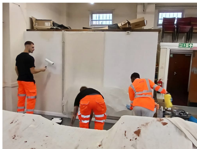
BBV volunteers painting at Ward End Well-being Centre

Teams from BBV, Sunbelt, and Reliable Contractors worked together to refresh and brighten the hall. Sunbelt provided the access platform for the high ceilings, while paint was generously donated by EH Smith and Selkent.