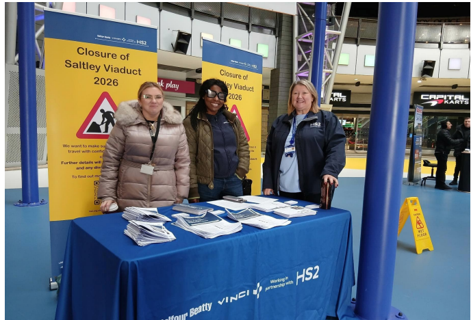
Community engagement team members at a Saltley Viaduct information event

Our community engagement team works along every section of the route, keeping residents informed and responding to questions. We also hold regular information sessions to share updates and hear feedback from the community.