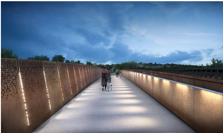
CGI visual showing new design of the Saltley Viaduct

Community feedback highlighted that over 75% of people wanted additional lighting on Saltley Viaduct to improve safety for pedestrians and cyclists at night. In response, HS2 has installed an LED lighting system integrated into the walkway's handrail, reducing light spill and helping protect local wildlife, including foraging bats.