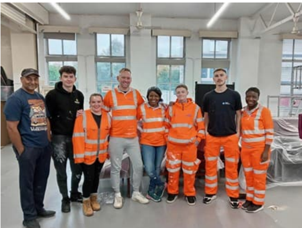
BBV volunteers at Ward End Well-being Centre

HS2 and BBV's Community Investment programme enables us to support those communities most impacted by our works. A recent example is the refurbishment of the main hall at Ward End Wellbeing Centre, delivered through the efforts of BBV volunteers and partners.