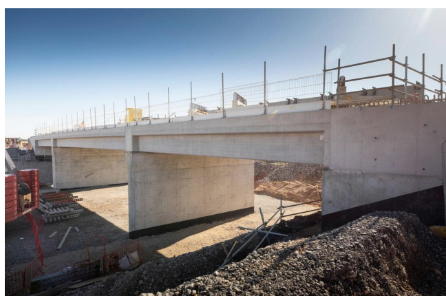
Church Lane Overbridge

Once this stage of work is completed, construction will pause as part of the wider project delay. The site will be closed down and secured in early 2026.