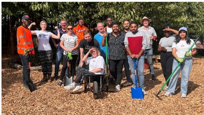
BBV revamping High Meadow School's outdoor space

With support from our landscaping contractor, Acorns, we donated 12 tonnes of wood chippings to revitalise the area.