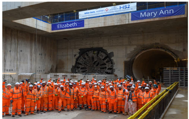
Project team gather for TBM breakthrough