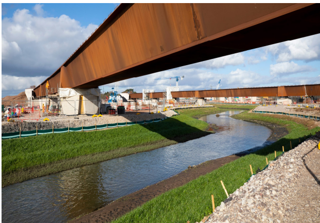
River Cole Viaduct and river realignment

The river has been reshaped to follow a more natural, meandering path with varied cross-sections, creating new habitats and improving flood resilience. Natural gravels were reused to form the riverbed, while biodegradable materials aid vegetation growth and erosion control.