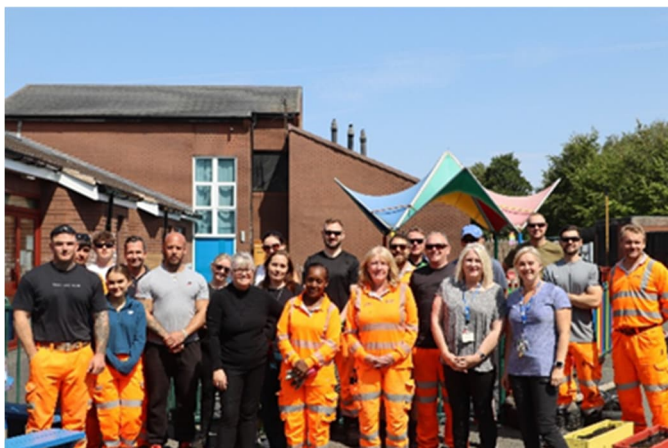
BBV volunteers helping local communities across North Warwickshire

These efforts ensure BBV's commitment to leaving a positive legacy beyond HS2. By partnering with local organisations and dedicating our time and resources, we aim to create lasting benefits for the people and places that make North Warwickshire special.