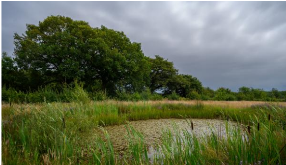
A pond on an EKFB environmental mitigation site

Throughout the Greatworth to Southam area, we have created 13 habitat sites. One of these is the Radbourne Fishponds, where ponds and areas of tree and hedgerow planting have occurred. This site has been colonised by great crested newts that have moved into the new ponds from the wider countryside. There are also areas of deadwood to support insects and grassland areas which support a diverse selection of mammals and reptiles, such as harvest mice and grass snakes.