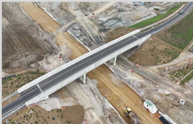
Claydon Road bridge opened to the public in the summer.

Claydon Road overbridge was the first HS2 structure in Northamptonshire to open to the public. This bridge retains local connectivity for the villages of Boddington and Claydon, over the line of the new HS2 railway. Claydon Road is also a popular walking and cycling route for the local communities and the opening of this bridge restores local connectivity and marks a significant step for the local area. While access along the Millennium Way national footpath remained open across the construction area, it has now been permanently rerouted over the bridge.