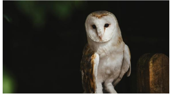
A Barn Owl

As time marches on and the weather grows colder, hibernation season commences. Across all our worksites, we will be adopting winter working measures, such as planning the timing of works to avoid disturbance to any habitats that could be used by wildlife during their hibernation.