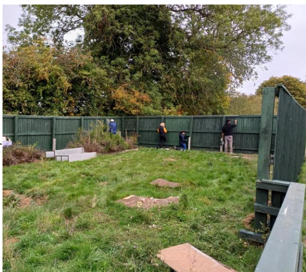
EKFB volunteers worked alongside local community volunteers to complete painting to woodwork at the Woodford Halse Food Larder.

This year we provided funds for transporting food donations and materials to update the building, as well as garden planters and benches. Our teams spent several days volunteering though the year, helping to run the larder sessions and painting the outside of the food larder buildings.