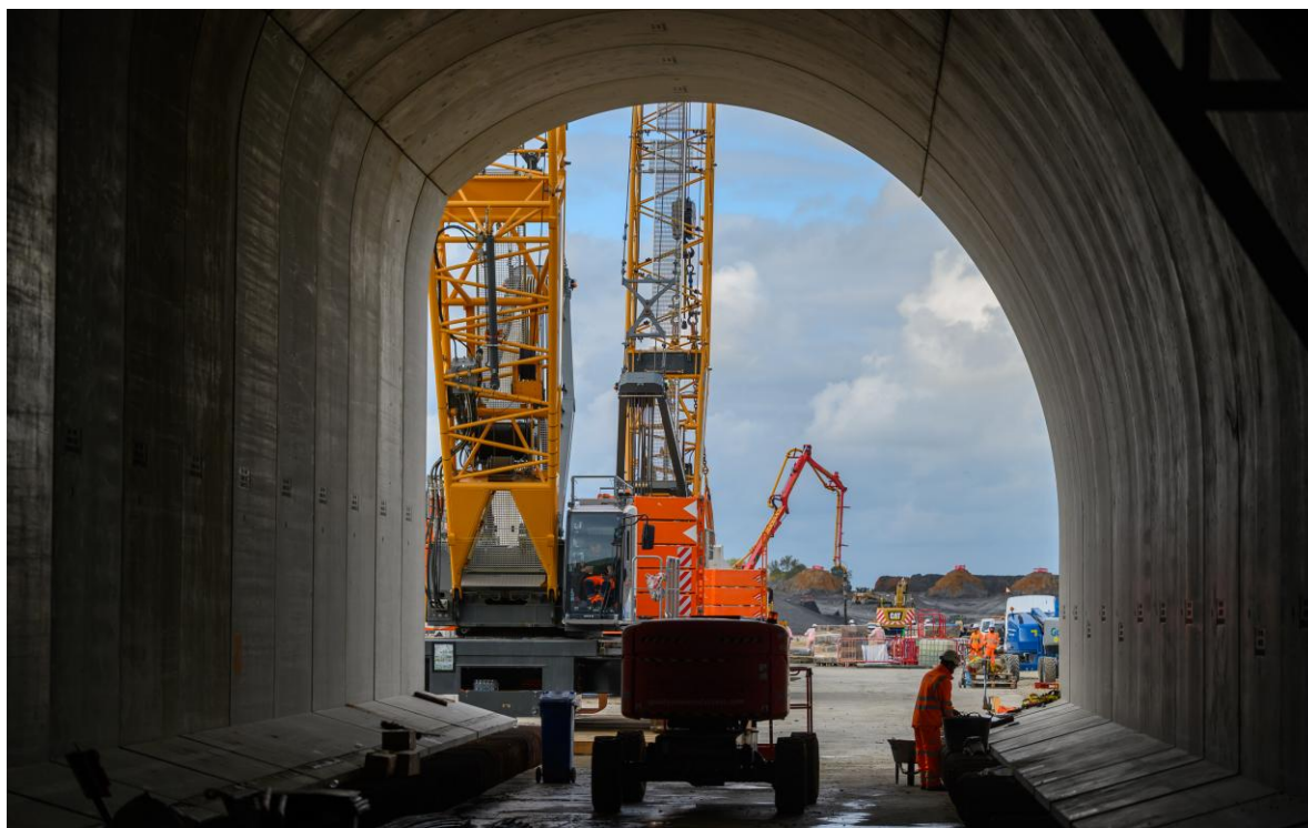
This photograph was taken inside the Greatworth green tunnel looking north towards Thorpe Mandeville. Construction continues throughout winter to both green tunnels, with occasional overnight working as