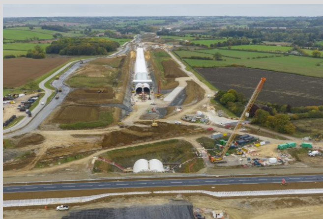
The realigned A361 opened to the public in September, taking traffic over the Chipping Warden green tunnel.

The construction of one of the longest 'cut and cover' tunnels along the HS2 route has progressed well, with the realignment of the A361 at Chipping Warden in September 2025, a milestone has been reached. The A361 was closed for 11 days, to allow the road to be safely realigned over the Chipping Warden green tunnel and connect to the Chipping Warden bypass completed by HS2 in 2022. The construction teams are now able to proceed with the construction of the remainder of the final section of the 2.5km tunnel.