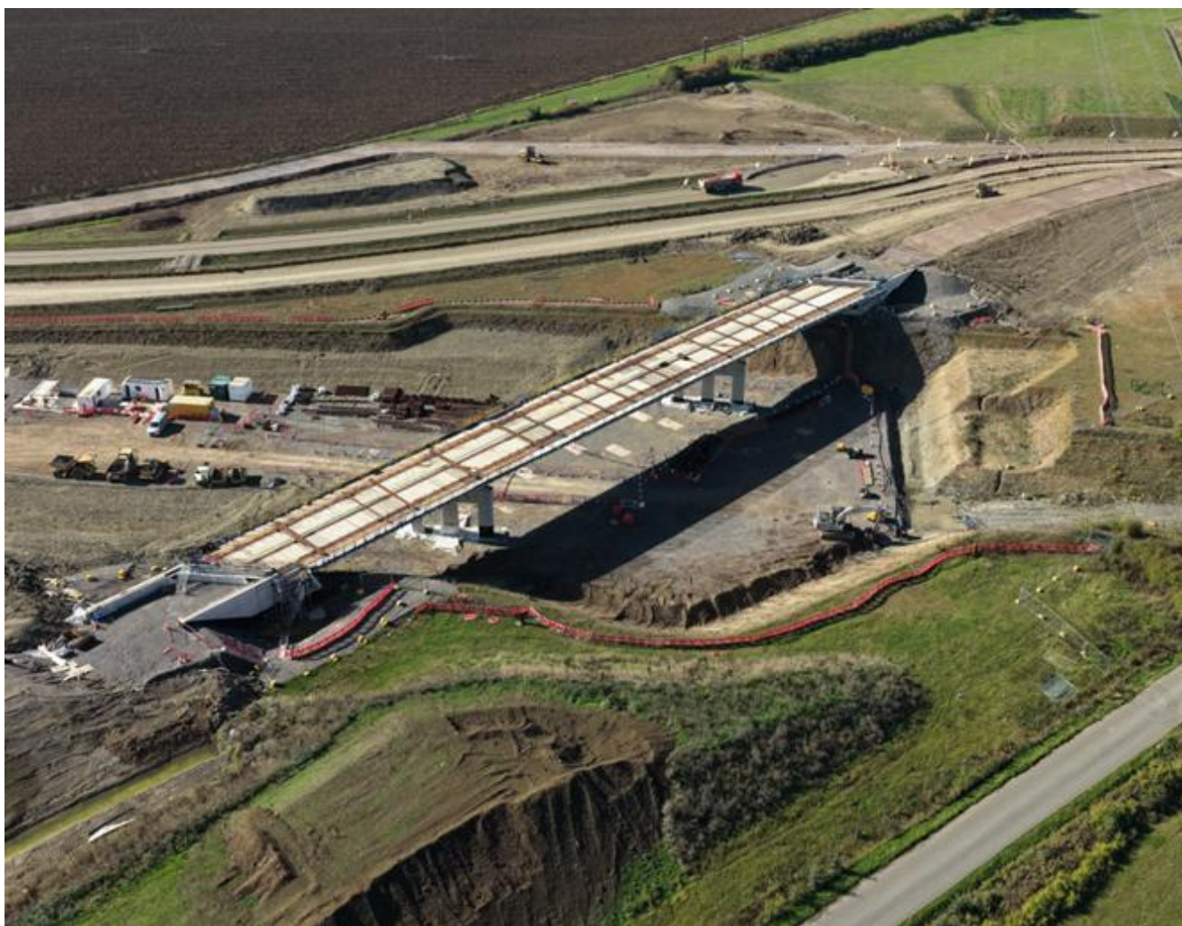
Edgcott Road bridge in construction.

The bridge deck construction continues with the parapets due to be installed in March 2026. The road is then expected to be open to the public shortly afterwards. We will keep you updated with progress as we head into 2026.