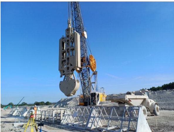
Hydraulic excavator in operation during low permeability wall works in summer 2025

Built in stages and anchored deep into the clay, the wall helps manage groundwater and reduce flood risk, protecting nearby brooks and supporting the long-term stability of the cutting.