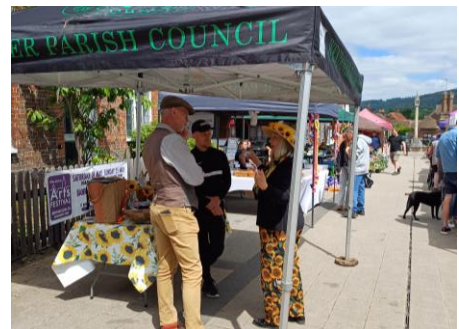
Handing out sunflowers and seeds in Wendover

At Wendover's produce market in May, EKFB Supported the Parish Council's "Make Wendover Smile" campaign. EKFB handed out sunflower plants and seeds for replanting, contributing to the enhancement of green spaces around the community.