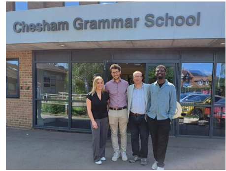
EKFB team at Chesham Grammar School

For the third year running, EKFB hosted an interactive STEM-led activity at Chesham Grammar School. The year 8 students learnt more about the world of civil engineering and took part in a competition to build a bridge using sticks to see which structure was the sturdiest. Well done to all the pupils who took part!