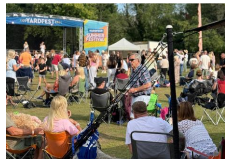
YardFest festival in Wendover, July 2025

We are proud to have supported this year's YardFest festival in Wendover, an event designed to bring the Wendover community together and showcase the incredible talent and creativity of local businesses.