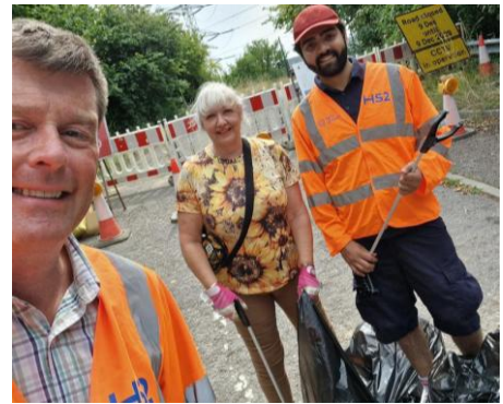
Community litter pick in Wendover

In August, EKFB teamed up with Wendover Parish Council for a community litter pick, covering areas including London Road, South Street, Bacombe Lane, and Ellesborough Road. We're proud to have worked alongside the Parish Council to make a positive impact in the community.