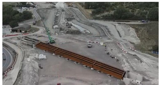
Aerial view of Nash Lee overbridge, August 2025

The overbridge is being constructed offline, away from the existing road. This approach helps minimise disruption until the final phase, when Nash Lee Road will be realigned to carry vehicles over the new structure in late 2026.