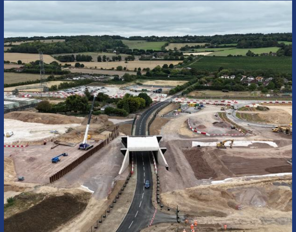
Rocky Lane underbridge and realignment following reopening

The plant crossing with two-way traffic lights will remain in place to allow the movement of our plant vehicles along our site access road. With Rocky Lane reopened, the Leather Lane closure commenced in September to enable construction of the overbridge.