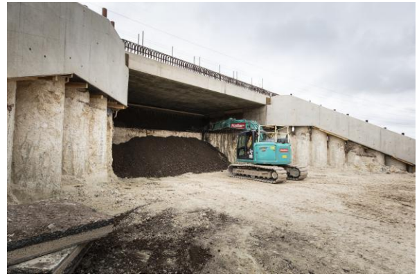
Excavation underneath Grove Farm underbridge, August 2025

Over spring and summer, the bridge deck at Grove Farm underbridge was installed and set. By August, all major concrete works for the side walls were completed. Following excavation underneath the bridge, the next phase will focus on building the inner wall. This top-down structure is on track to be completed by the end of the year.