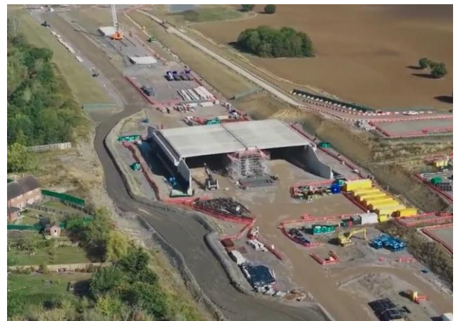
The image above shows School Hill overbridge, with Calvert village to the left.

Works to this bridge will continue throughout this year and next with the plan to open the bridge to traffic in late 2026.