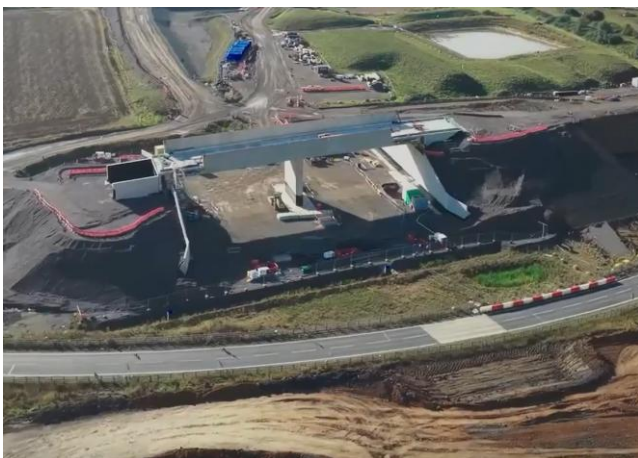
The image above shows West Street overbridge with parapets complete

A planned closure of Steeple Claydon to Twyford Road is scheduled for late 2025 and will remain in place until late 2026, when the new road alignment will open to traffic.