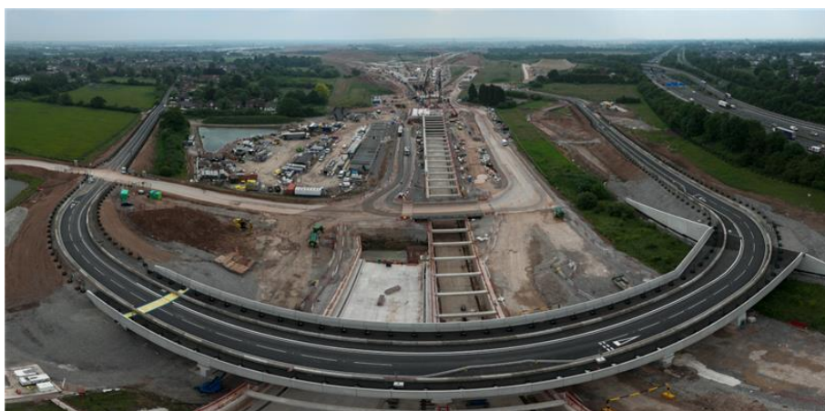
Works on the Attleboro Lane Overbridge

We recently completed works around Attleboro Lane to tie-in the re-aligned road onto the Attleboro Lane Overbridge. The Attleboro Lane Overbridge will carry traffic over the HS2 railway serving properties at the south end of Attleboro Lane. It also connects the existing public right of way routes for pedestrians and cyclists into Castle Bromwich.