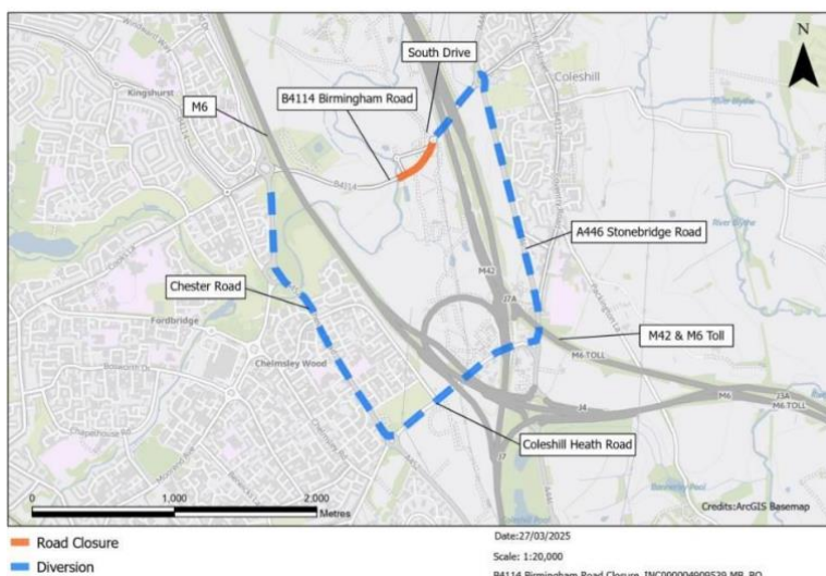
Planned diversion route

The B4114 Birmingham Road successfully re-opened on its original alignment at the end of May. This milestone follows a 15-month closure that allowed us to lower a new section of the road offline in order to pass safely under the new viaducts. Careful planning and execution meant this was achieved without causing disruption to road users. The existing road diversion that had been in place since February 2024 has also been removed.