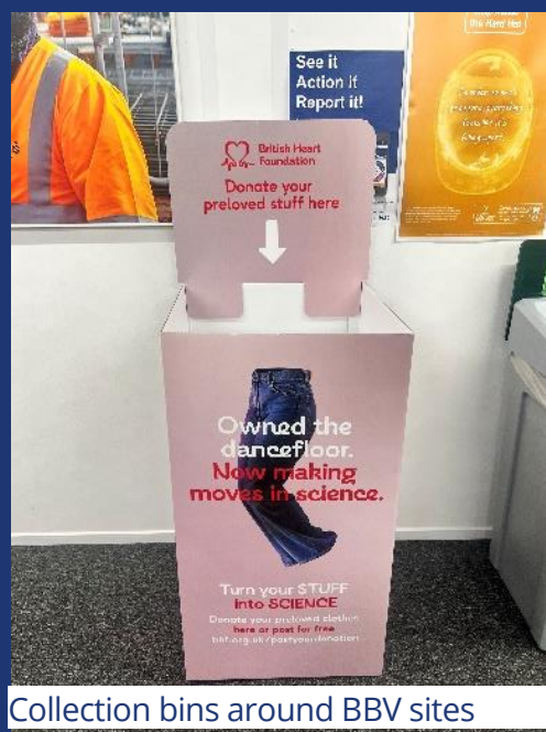
Collection bins around BBV sites