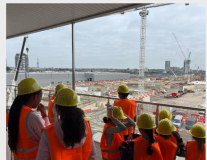
Local children from the Old Oak Community Centre holiday camp, enjoying the viewing gallery

The holiday camp is organised by Bubble & Squeak, a local community organisation run by Lydia Gandaa. In January, HS2's Atlas Road Logistics Tunnel broke through into the station box, and the tunnel boring machine used to complete the works was named Lydia, in recognition of her contribution to the local area.