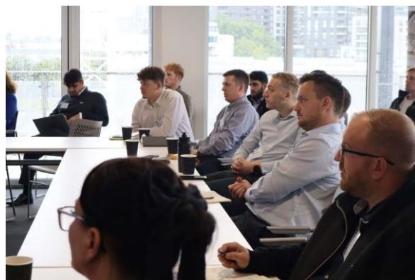
Representatives from local businesses at the Future Supply Chain Opportunities event