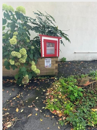
Little library placed on planter on Channel Gate Road

This initiative would provide the community with easy access to books, encouraging them to borrow, share, and exchange their favourite stories. A little library not only fosters a love for reading but also promotes a sense of community and responsibility, as children and adults alike take turns contributing and caring for the books.