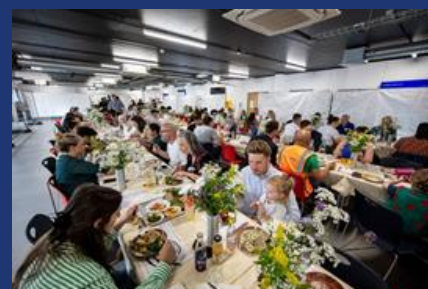
The Absolute Beginners lunch service at Old Oak Common