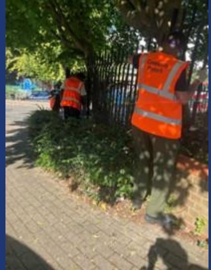
Probation volunteers scraping old paint off Victoria Gardens railings

As a result of this collaborative work, some of the volunteers have been inspired to take up painting professionally.