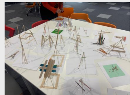
Children's structures made from matchsticks