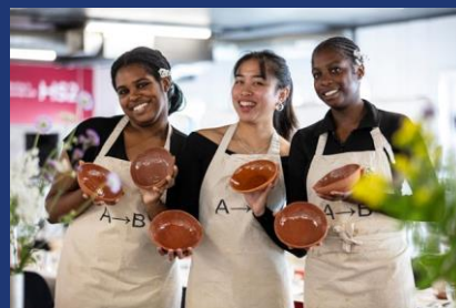
Young artist group Absolute Beginners with their clay creations

The project is part of HS2's commitment to working with local communities and supporting sustainable practices. The team from Absolute Beginners made the 'low speed plates' in their unique way, using off-grid power, local materials and simple tools. The new sustainable crockery will be used to celebrate construction milestones through annual meals with the