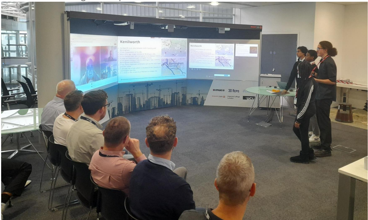
Work experience students presenting to Mace Dragados Senior staff in our Control Room