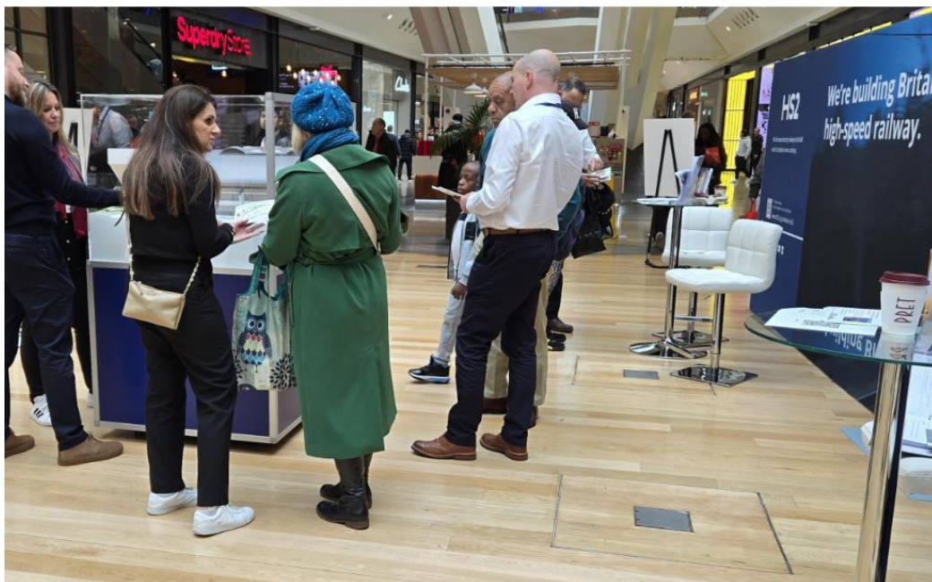
Engagement event at the Bull Ring