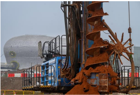
Piling rig on site

With piling well underway, the transformation of the Eastside and Digbeth is coming a step closer.