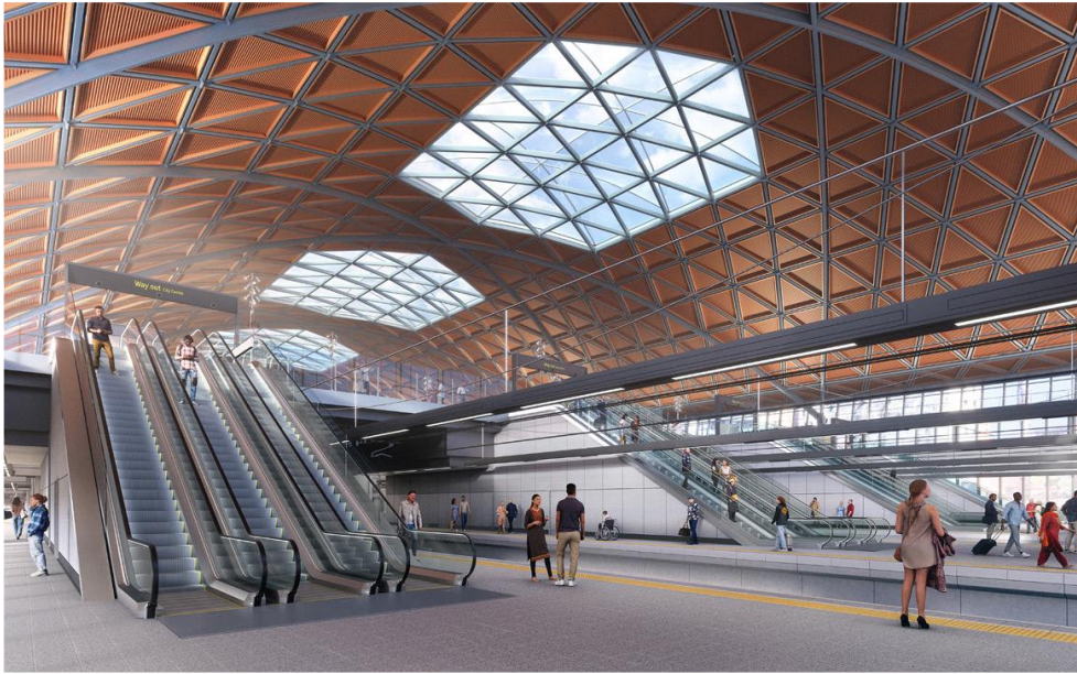
Artist impression of Curzon Street station from platform level

The vision for the station remains the same, with Curzon Street station poised to become a vibrant gateway and key destination on Britain's new high-speed railway. The design draws inspiration from the magnificent arched roofs crafted by Victorian railway engineers. It translates that legacy into a modern vision that prioritises accessibility and complements the surrounding open spaces and landscaping.