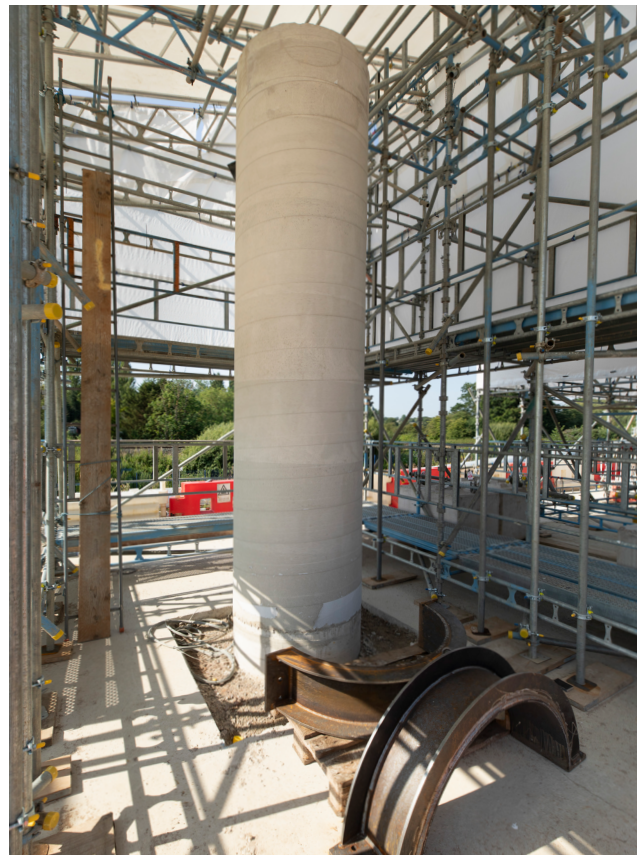
Noise barrier testing

The realignment will be completed soon. We will then focus on improving the footpaths and landscaping the area.