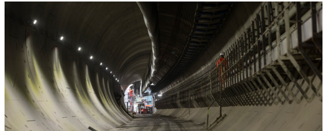
Our TBMs have now built nearly eight miles of tunnels

Our tunnel boring machines (TBMs) Sushila and Caroline have now built nearly eight miles (13km) of tunnels and will reach the end of their tunnelling journeys at Green Park Way Vent Shaft in Greenford this winter.