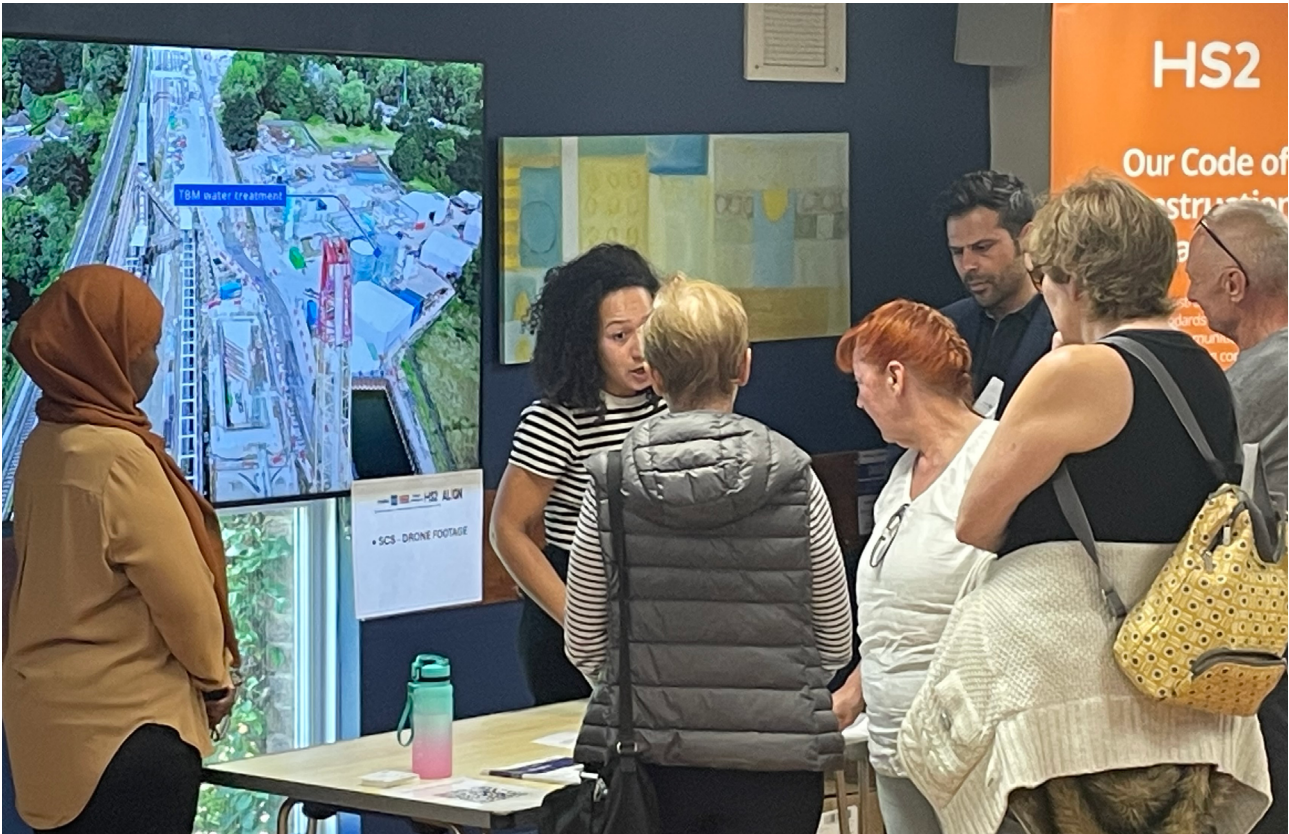
SCS community engagement team presenting drone footage to local residents at Harefield Community Centre on Tuesday 17 September 2024