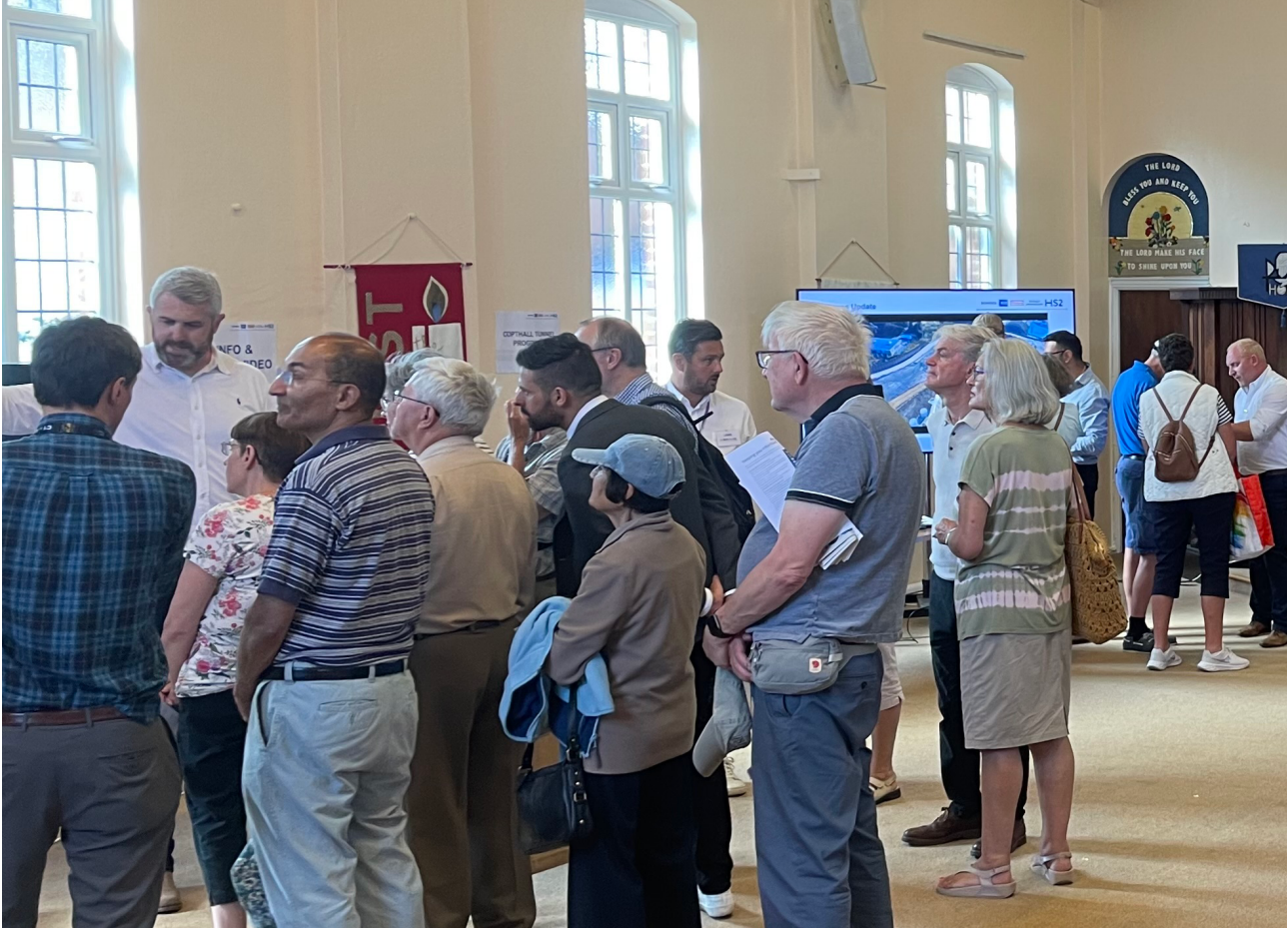
We were pleased to welcome 97 local residents to our community event at Ickenham United Reformed Church on Tuesday 23 July 2024