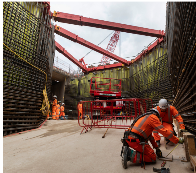
Our site team in action building the South Ruislip Vent Shaft

will help it blend in with the natural environment. We will integrate the vent shaft and headhouse into the green corridor, leaving a lasting legacy along this crucial part of the HS2 route.