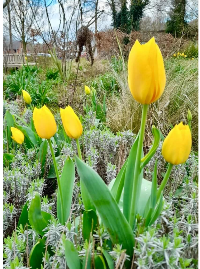
The healing and peace gardens at Harefield Hospital

We have announced just over £17.3m of funding to 312 CEF and BLEF projects across the Phase One and Phase 2a line of the HS2 route. Sixteen of these awards are for Hillingdon-based initiatives.