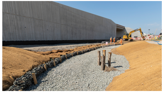
The new riverbed is now in place as part of the River Pinn realignment works

We are currently testing noise barriers in the section between the bridge over Breakspear Road South and the Copthall Tunnel. This involves a hydraulic rig pushing and pulling existing columns, and should not create a noticeable noise.