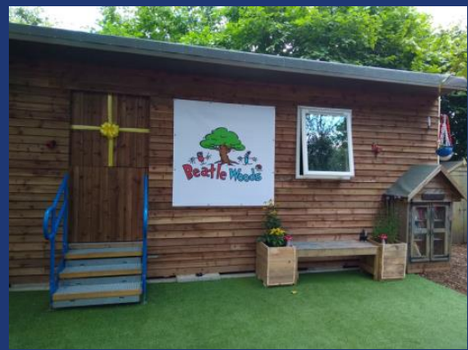
The new cabin will offer shelter to all children instead of small groups

With the help of our supply chain, we also helped to construct a brand-new play cabin allowing children and staff to stay warm and dry. The new cabin was built by sub-contractor Keltbray and includes boot lockers and a kitchen area. Additional materials were also provided by our supply chain partners.