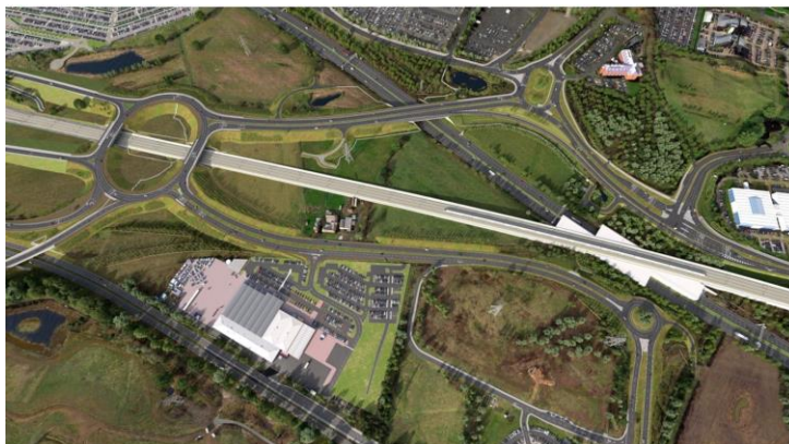
An arial view of the M42 box structure

A. The purpose of the box is to carry the new railway over the M42 motorway and connect two embankments, one of which leads to the new Interchange Station and the other towards Birmingham and Staffordshire. It is a structure consisting of two boxes and for the road users it will feel like entering two short tunnels rather than passing under a bridge. We will be building this structure while the motorway remains in operation.