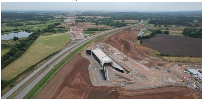
Construction of the A452 overbridge

We will keep communities and stakeholders updated as we progress these works in early 2025.