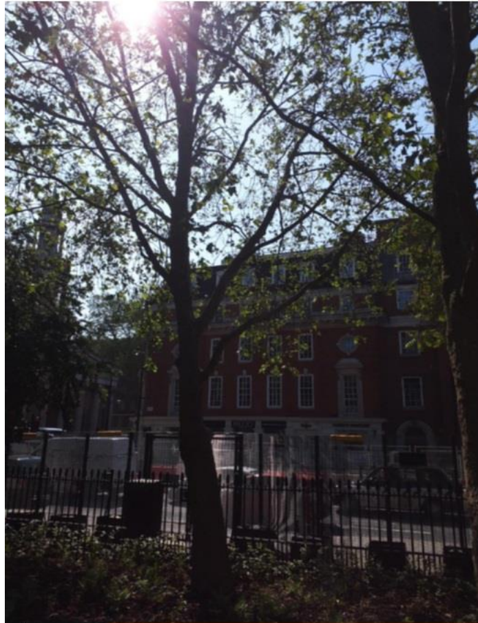
Photograph No 3: General overview of T6.