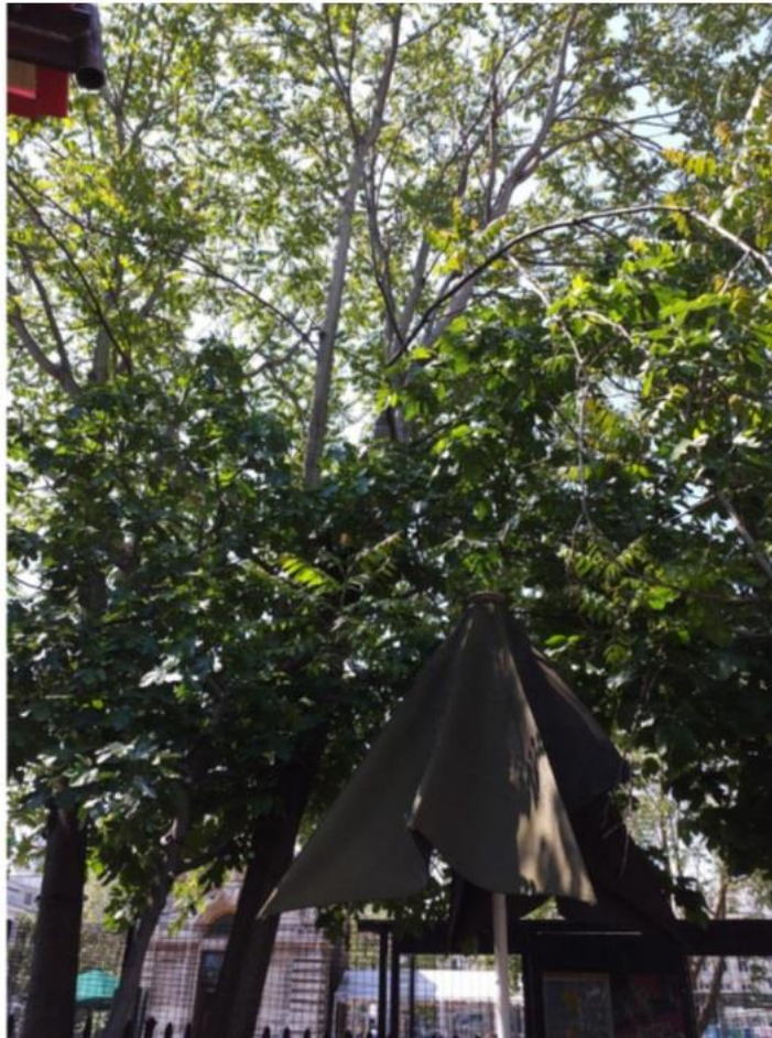
Photograph No 7: General overview of T28.