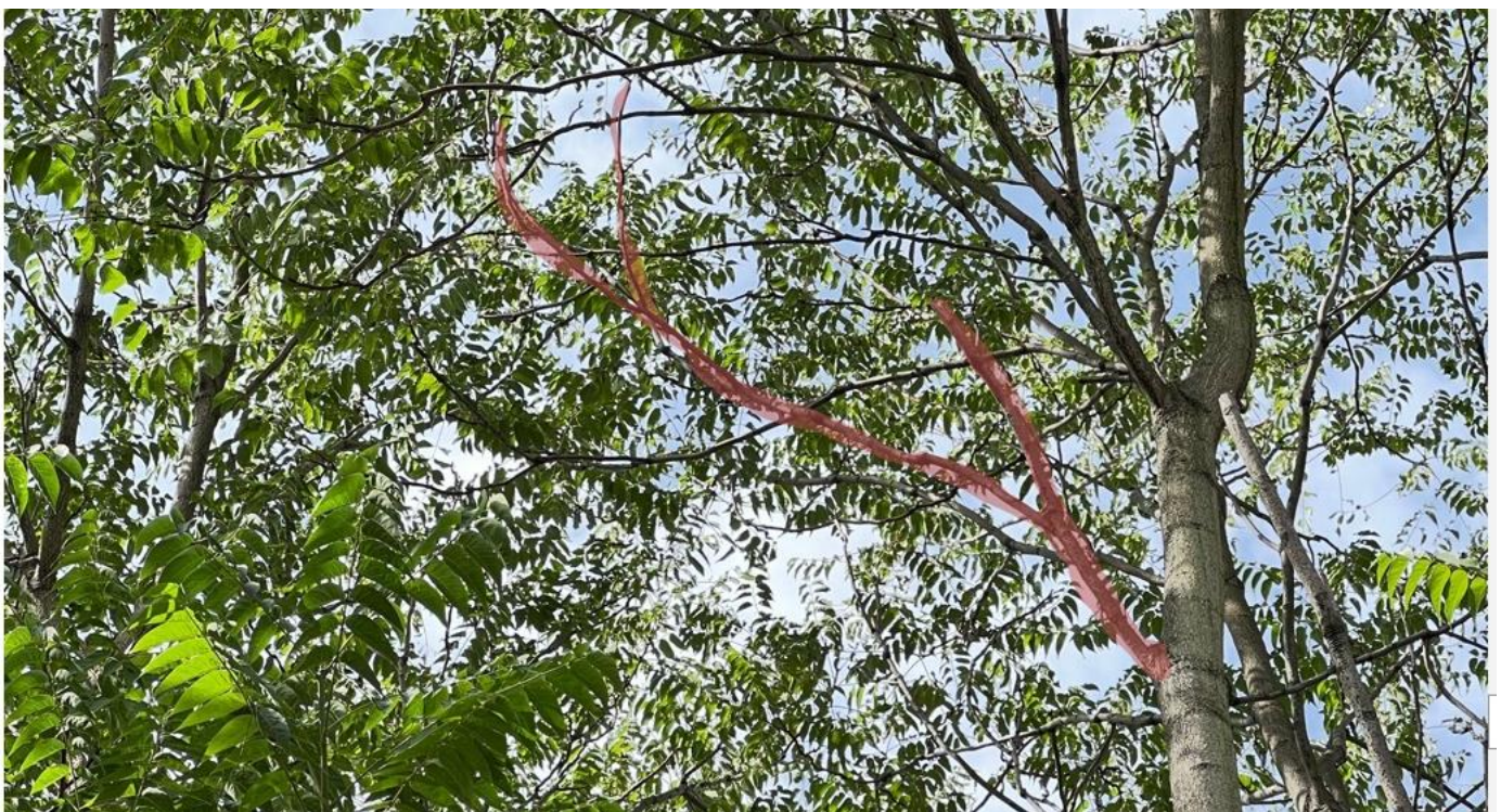
Photograph No 8: Deadwood to be pruned on T28.