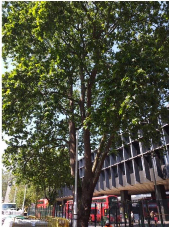
Photograph No 5: General overview of T26.