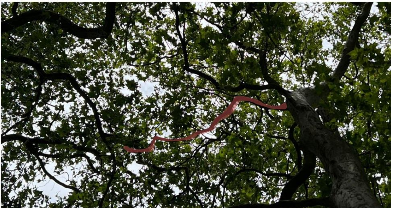
Photograph No 2: Deadwood to be pruned on T1.