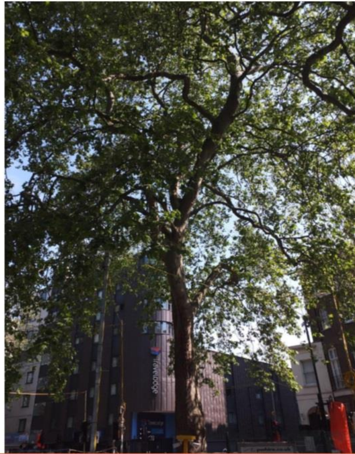
Photograph No 1: General overview of T1.