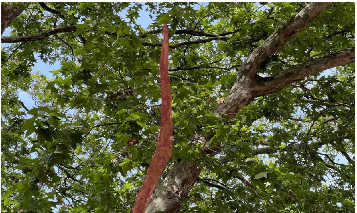
Photograph No 6: Deadwood to be pruned on T26.