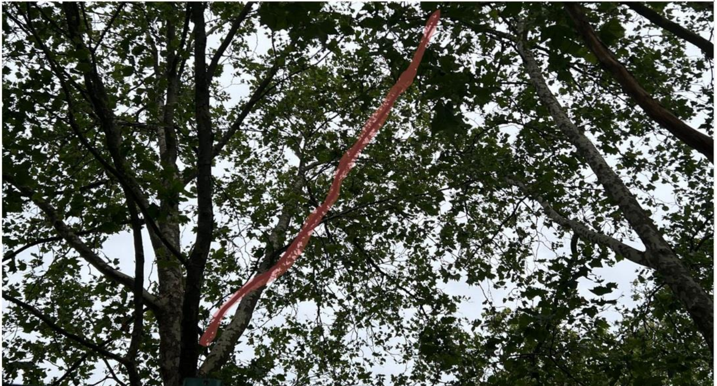
Photograph No 4: Deadwood to be pruned on T6.