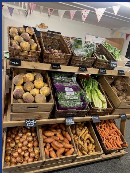
Figure 5: The image above shows the Northants Food Larder, February 2024.

As part of supporting local communities and in collaboration with the food larders in Northamptonshire, we have recently assisted with the collection and delivery of donations.