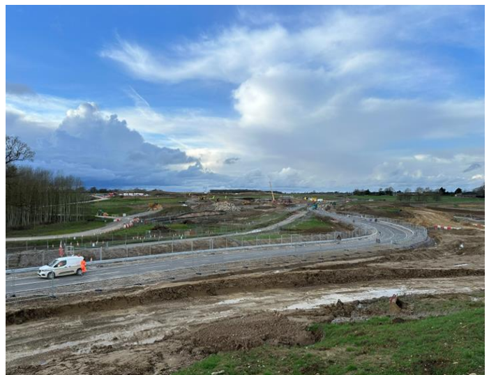
Figure 3: The image above shows the new Radstone Road Temporary Diversion, March 2024.

A: Yes. Once the new overbridge has been constructed, we will need to remove the temporary diversion and tie in the new permanent overbridge to the road network. These works are expected to take place in 2025 and will require full overnight road closures. We will update communities as our works progress.