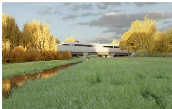
Figure 4: View of south abutment of Godington Viaduct and diverted Padbury Brook.

This spring our teams also began the installation of the steel structure and formwork for the bridge deck of the CHW/18 Overbridge. Work for the bridge deck is expected to take place this summer. This overbridge is expected to be completed in late 2024.