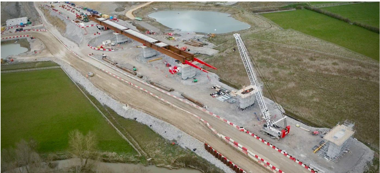
Figure 1: The photo above shows Westbury Viaduct under construction.

The 320-meter-long Westbury viaduct, near Brackley, is designed to carry the railway over the River Great Ouse floodplain. It will be supported by seven evenly spaced piers, each up to 9.2 meters tall. This impressive viaduct is one of 50 major viaducts on the HS2 project, of which, EKFB is building 15. Impressively, the design and build of this viaduct has cut embedded carbon by an estimated 60%.