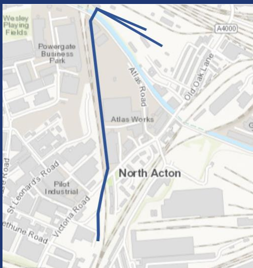
Approximate Conveyor Location

The Northolt Tunnel East will have two conveyors, one for each TBM, which will remove spoil from the construction of the tunnels. These conveyors will serve the Victoria Road Crossover box site, and the Atlas Road site. The approximate location of the conveyors can be seen on the map on the left. Ahead of the launch of the first TBM, the first conveyor began moving material in early January. The second conveyor will begin moving material before the launch of the second TBM. These conveyors will run 24/7.