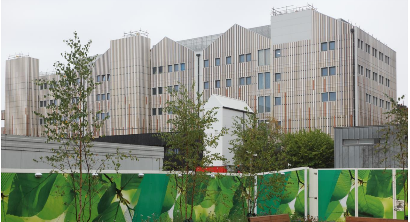
Image of the Euston Skills Centre Opening in January 2024 view from NTH Garden

The Euston Skills Centre located in the Maria Fidelis Old School building was handed over to the LB Camden on 30 October 2023. The facility will provide training opportunities for local people and will open in the early new year. For further information please visit www.camden.gov.uk/reducing-impact-hs2