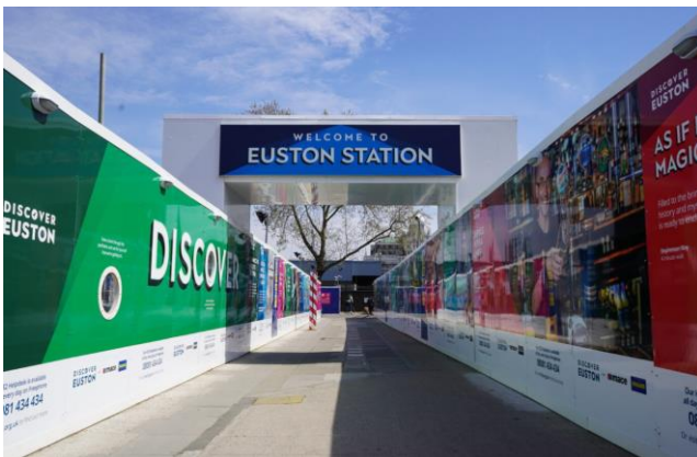
Image of hoardings and pedestrian route to Euston Station