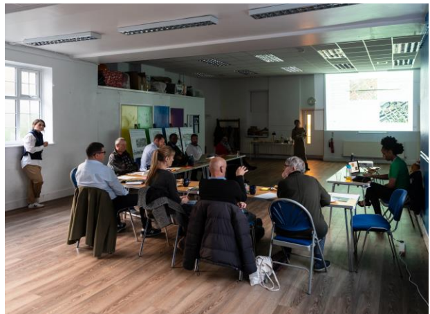
Image from an October 2023 engagement event

Our aim is to install the design ready for community use after the Interim Taxi Rank becomes operational in spring 2024.