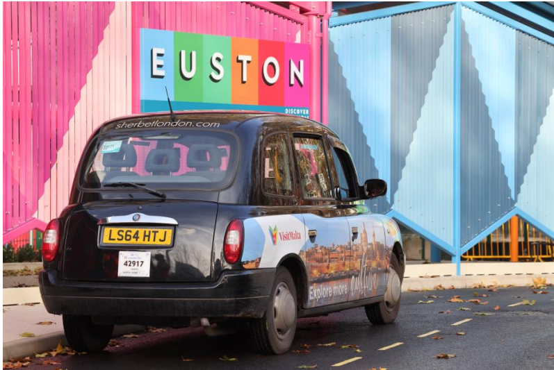
Image showing taxi safety audit in interim taxi rank December 2023

The main works to construct the interim taxi rank facility in the east side of Euston Square Gardens is complete. There will be a period of testing and commissioning to ensure the new rank is ready to open.