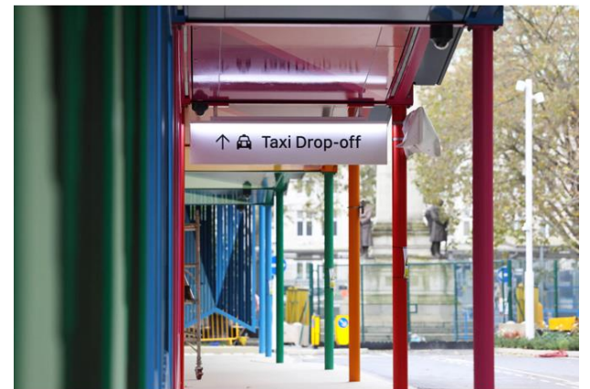
Images showing the interim taxi rank