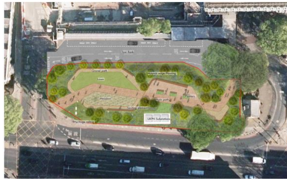
Image: concept design of Euston Square Gardens West; this is not the final design

We held engagement events in October 2023 to ask for community input to help shape the design for the temporary use of this area. A final design is close to completion and will be shared in the new year.