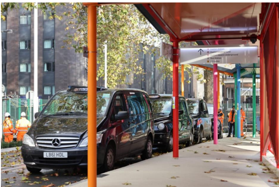
Image showing taxi safety audit in interim taxi rank December 2023