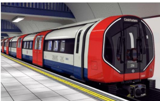
Image of a new Piccadilly Line train which will be in service in 2023

For further information about the Piccadilly Line upgrade, please visit: www.tfl.gov.uk .