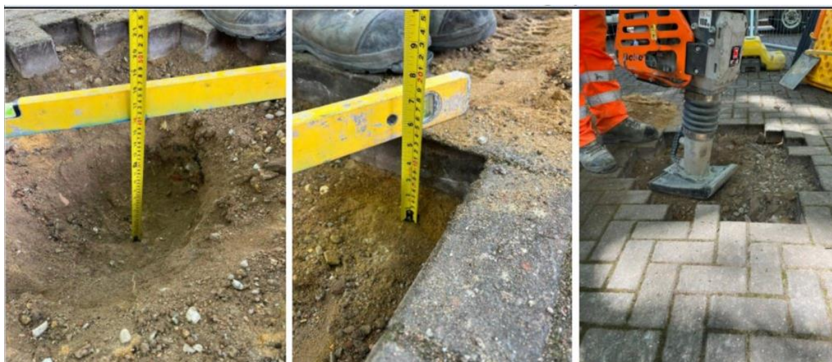
Images showing highways works