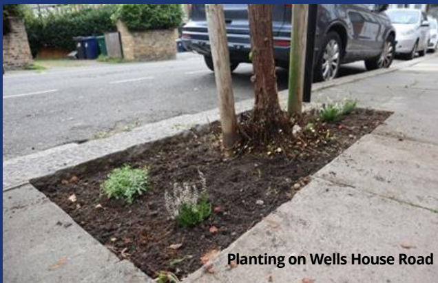
Planting on Wells House Road