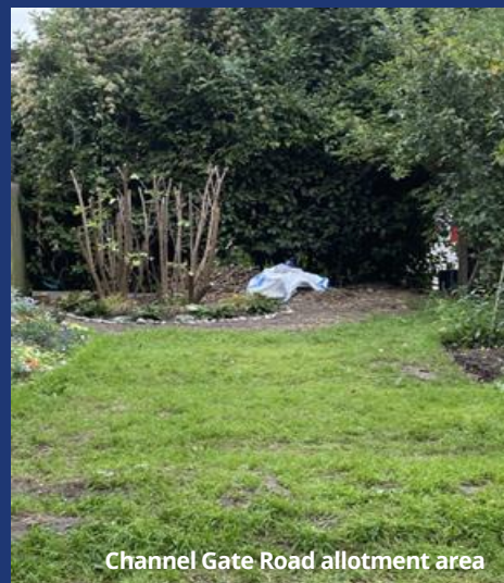
Channel Gate Road allotment area

Over the past few months and as part of our continued support, the team at the Willesden Euroterminal site have supplied recycled planters, security fences and collected green waste to help the local community use and enjoy the "allotment area" on Channel Gate Road, below. Local children on the road are using the area to achieve their bronze Duke of Edinburgh award.