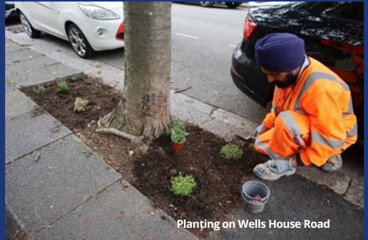
Planting on Wells House Road

We're looking forward to seeing the street in bloom in the spring.