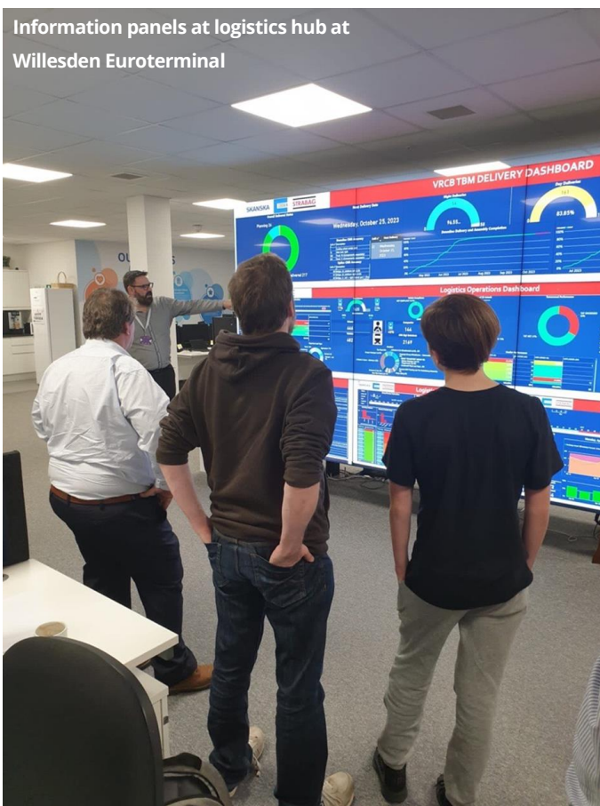
Information panels at logistics hub at Willesden Euroterminal

We are planning more visits to the HS2 sites in the area and further which will be advertised on the HS2 website in the new year.