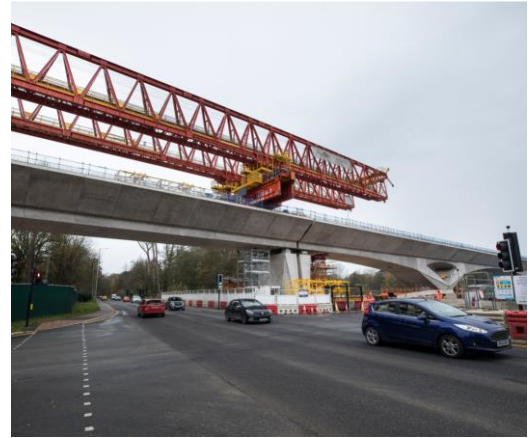
Launching girder crossing Moorhall Road.

This was done overnight over three weeks at the start of September this year and works were completed one week ahead of schedule. 48 parapets were installed on the section above the A412. 1500 will be needed along the two miles of the viaduct in total. Thank you for your patience and understanding during these works.