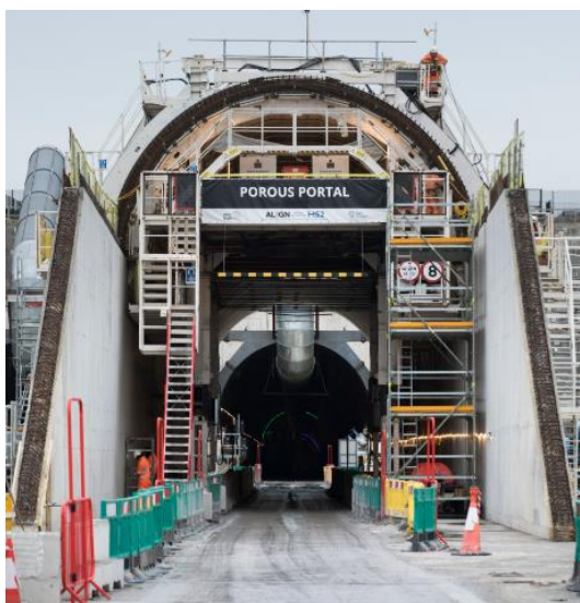
A support frame is used to cast the Porous Portal.

The two porous portals – one for northbound, and one for southbound trains – are aligned to be slightly staggered to further reduce any noise caused by trains entering and exiting the tunnel at the same time. This design will be replicated at the North Portal, near Great Missenden, Buckinghamshire.