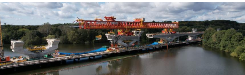
The launching girder installing sections of the viaduct deck between two piers.

It has been a very eventful year on the C1 section of the HS2 route and great progress has been made on the construction of the Chiltern Tunnel in Buckinghamshire, the Colne Valley Viaduct between Buckinghamshire and London Borough of Hillingdon, and the landscaping of the Colne Valley Western Slopes in Hertfordshire. On 6 December we will be holding an online webinar where we will review the key milestones achieved this year and look ahead at the works to come in the new year.