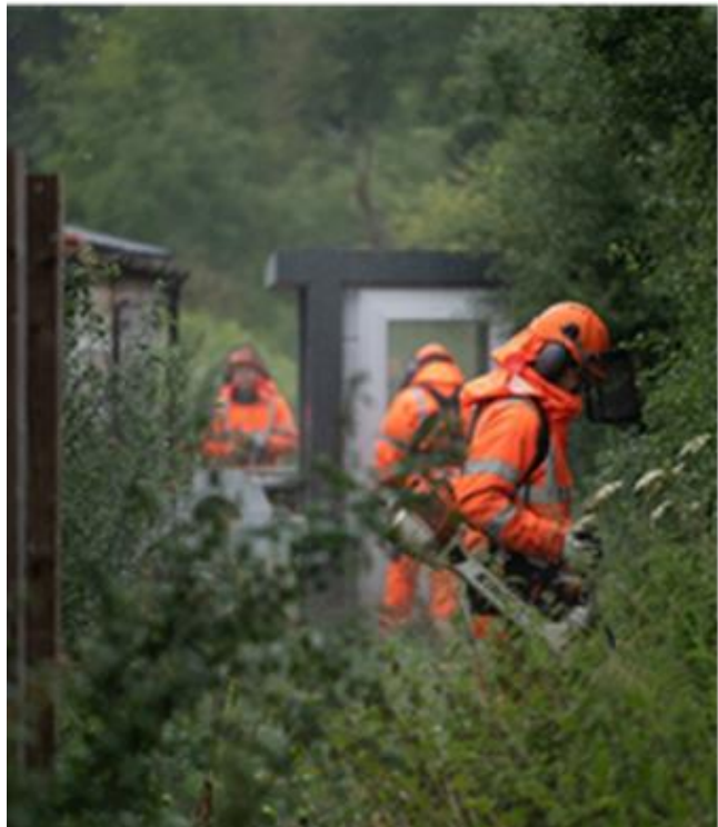
Volunteers work to clear the new site for PWHRC.

Contact us by email to: communityengagement@alignjv.com