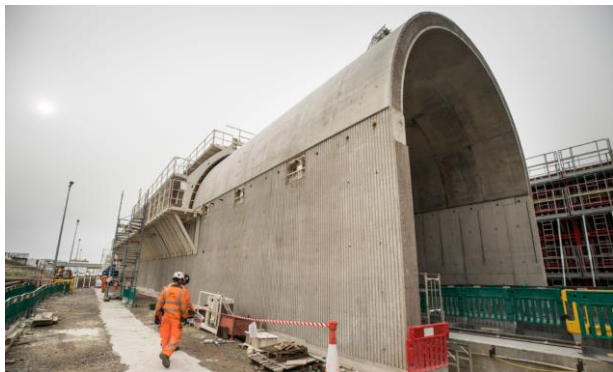
A Porous Portal constructed out of concrete.

Since early summer we have been constructing the porous portal hoods which will disperse air pressure created by the trains as they go in and out of the Chiltern Tunnel.