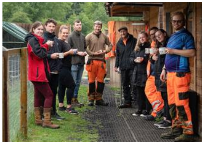
Align's volunteers have a break for tea.