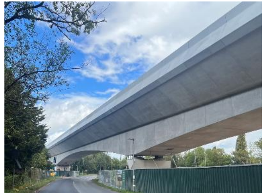
Viaduct parapets installed over the A412.