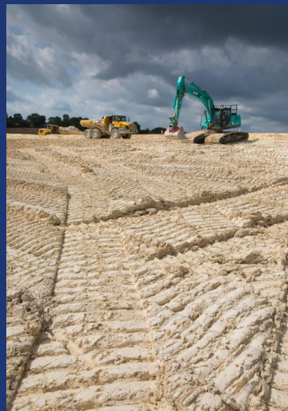
Chalk from the Chiltern Tunnel is repurposed and used to create the new landscape.

Work to replace topsoil and fence the landscape in sections of the site are now well underway. To read more about the plans for the site visit: www.hs2.org.uk/building-hs2/environmental-sustainability/green-corridor/