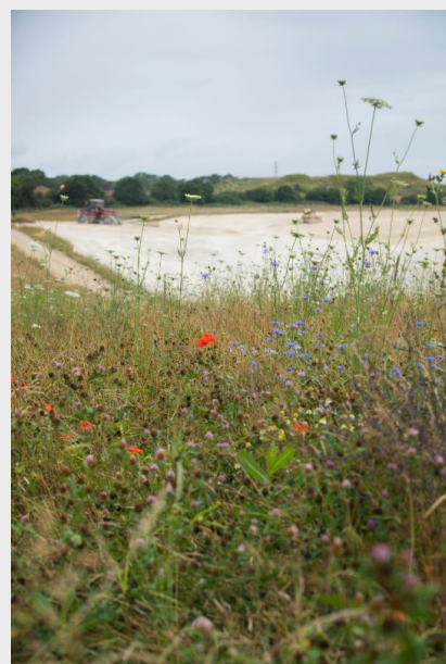
Soil and seeding trials on the Colne Valley Western Slopes.

The chalky spoil removed from the tunnel boring machines (TBMs) that are digging the Chiltern Tunnel is treated and dried onsite before being applied to the landscape to create the perfect growing medium for calcareous grassland.