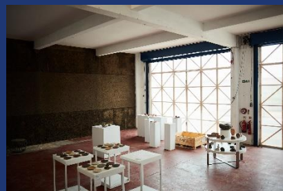
HS2 clay on display at the Park Royal Craft Fair 2023

https://www.parkroyaldesigndistrict.com/craft-fair-2023