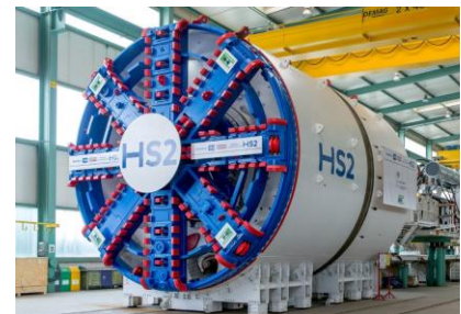
HS2 Tunnel Boring Machine

Our contractors Balfour Beatty Vinci Systra (BBVS) and Skanska Costain STRABAG joint Venture (SCSJV) are continuing works in Old Oak and North Acton to build the new railway.