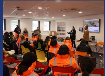
Women's Open Day at Old Oak Common Station Visitor Centre

The event was an opportunity to break down the barriers, showcase what working in construction is really like and provide guidance for women interested in entering the industry.