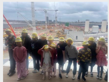
Holiday camp children on the Old Oak Common Station viewing platform

The children, all aged between 5 and 12, spent the afternoon learning how construction supports other jobs and industries using When I Grow Up - a book written by Rich Smith to inspire school children and engage with STEM subjects from a young age.