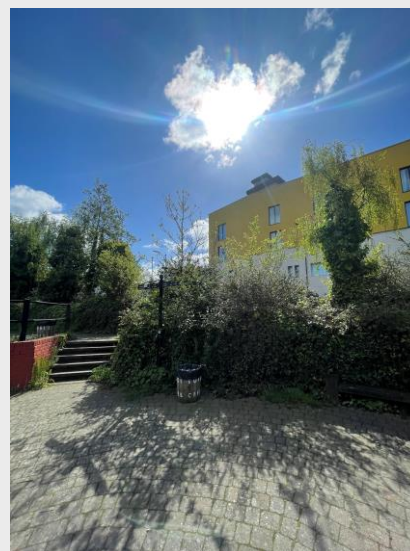
The Grand Union Canal after the litter pick

The BBVS and SCSJV volunteers' hard work and determination have preserved the beauty of our local environment, creating a cleaner and more welcoming space for everyone to enjoy.