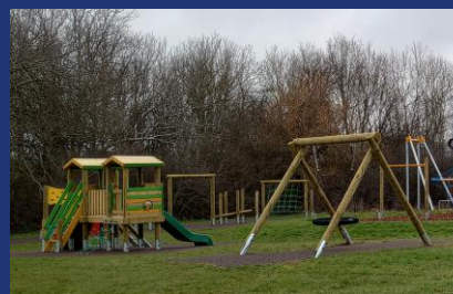
The new playground equipment in Wormwood Scrubs

The CEF funded playground for Wormwood Scrubs was recently installed, pictured on the right.