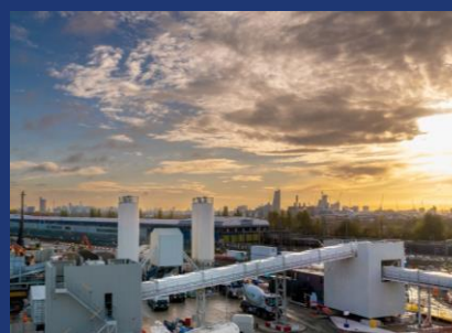
The BBVS conveyor

The conveyors meet at the HS2 Logistics Hub at Willesden Euro Terminal, and the materials they carry are taken away from the area by train and used at other sites.