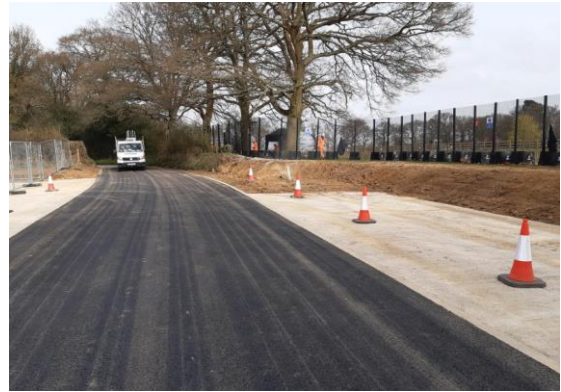
Re-surfacing of Leather Lane for access road crossing points.

We are constructing a concrete batching plant at the Chipping Warden compound. A concrete batching plant is used to create, store and distribute concrete locally to the project. This will help to take additional HGVs off the road. All batching plant activity is very well controlled and monitored. The modern equipment that we use has a 'sealed system.' Cement is pumped into silos and the mixing process prevents dust escaping into the atmosphere.