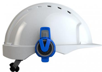
Example of a Plinx hat