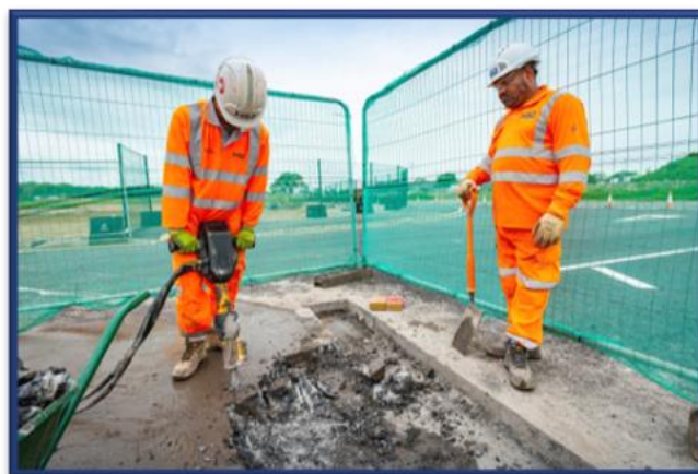
Completing works safely with traffic management

We will require traffic management relating to the programme of works that will continue. This will range from temporary traffic lights, lane closures and closures to safely complete our works. We will communicate any traffic management in advance of works commencing.