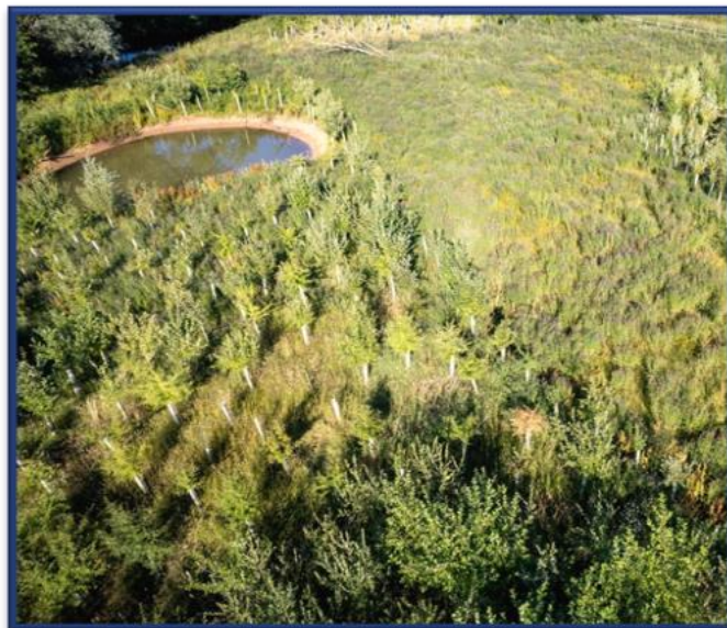
Undertaking non-intrusive environmental surveys

In North Warwickshire, we will be undertaking non-intrusive environmental surveys where we observe, measure and take notes and photographs of the local environment and ecology in woodlands, waterways, buildings, agricultural land and archaeological or heritage sites. We will assess and monitor water levels in our balancing ponds and may occasionally use pumps to manage seasonal increases. We will additionally be hydroseeding areas of our sites where we have paused earthworks to control soil erosion. Hydroseeding is a planting process that uses a combination of seed and mulch. It is an alternative to traditional methods like sowing dry seeds.