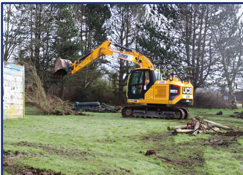
BBV and subcontractor, L. Lynch Plant Hire, completed landscaping work to prepare for the new football pitch.