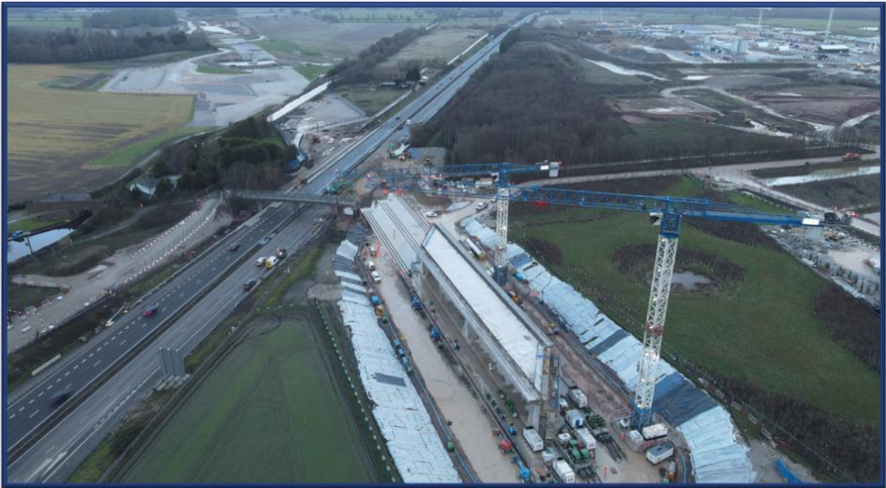
Marston Box Bridge 'box-slide'.