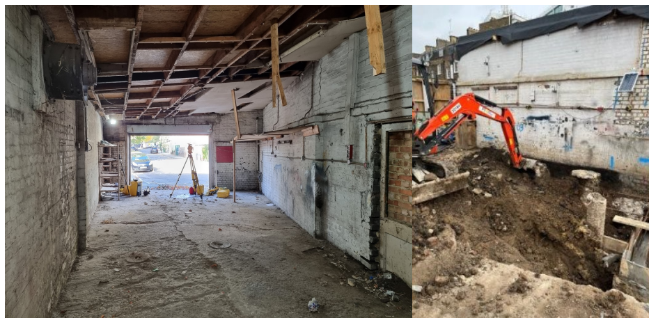
Here are some early photos of work to demolish the former garage building on Clarkson Row.