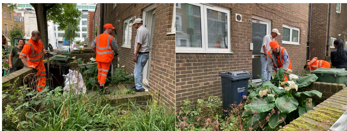
A team from the Clarkson Row worksite and Network Rail worked with the Clarkson & Mornington tenants & residents association (TRA) to clean up some front gardens. This has since enabled residents in the area to add new plants and flowers to their gardens.