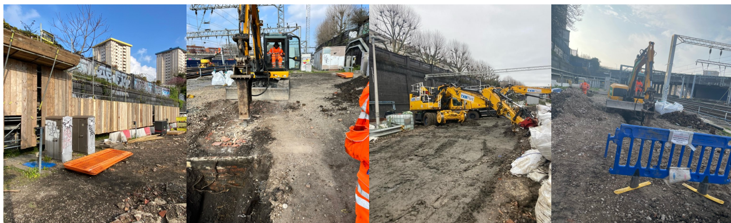
Once we had demolished the garage at street level, we started to create the foundations for the access point.