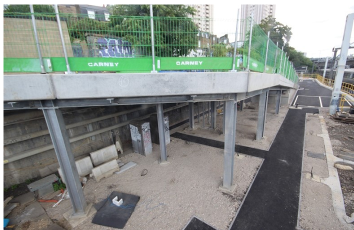
This photo shows the completed ramp down to track level.