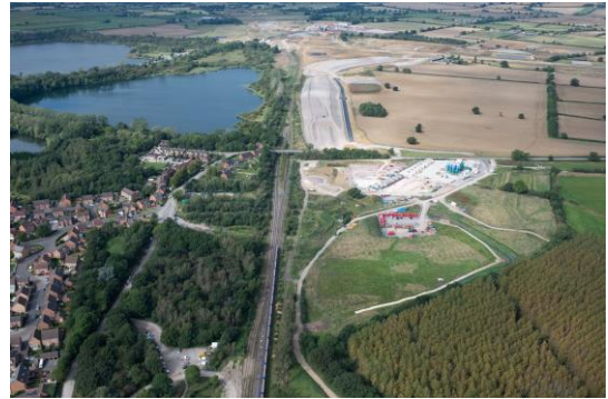
School Hill Compound and Calvert Green, September 2021.