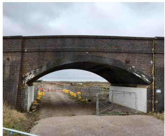
Pictured above, Addison Road Bridge, Steeple Claydon, February 2022.

We understand the impact Addison Road bridge's closure has brought to the local community, and we are doing everything in our power to ensure these works are completed on time to allow the public to use this road again safely.