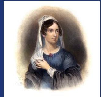
Lady Anne Byron