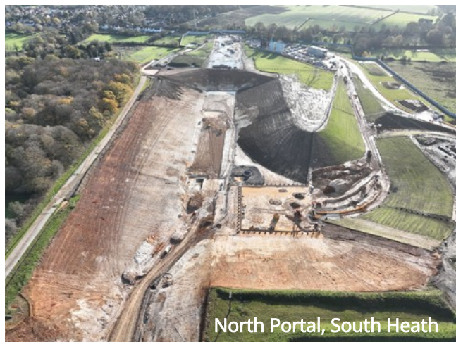
North Portal, South Heath

Register for the webinar at: https://Chiltern-Tunnel-North-Portal-Update.eventbrite.co.uk