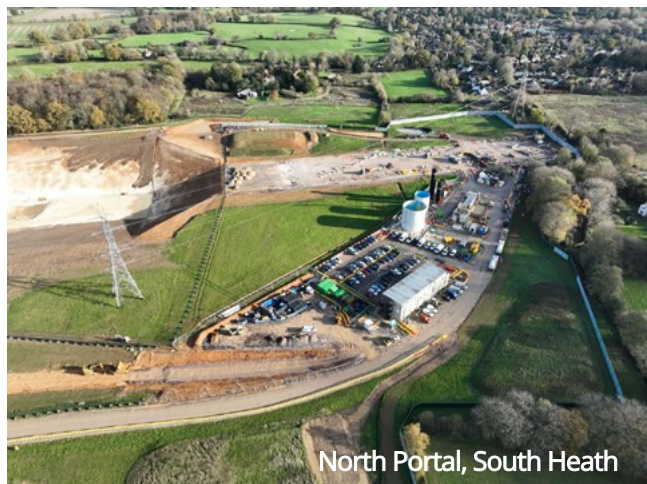
North Portal, South Heath

We are working alongside the adjacent joint venture company constructing the railway, EKFB, who are building the railway line from the North Portal northwards towards Wendover, Buckinghamshire through to Warwickshire .