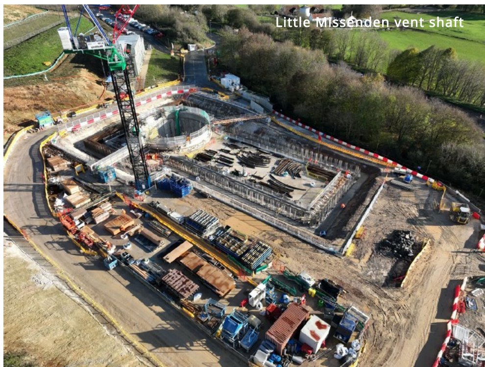
Little Missenden vent shaft

The main activities at the Little Missenden vent shaft site include the construction of the internal shaft structure which requires regular concrete pours. Our tunnel boring machines will reach this vent shaft this summer.