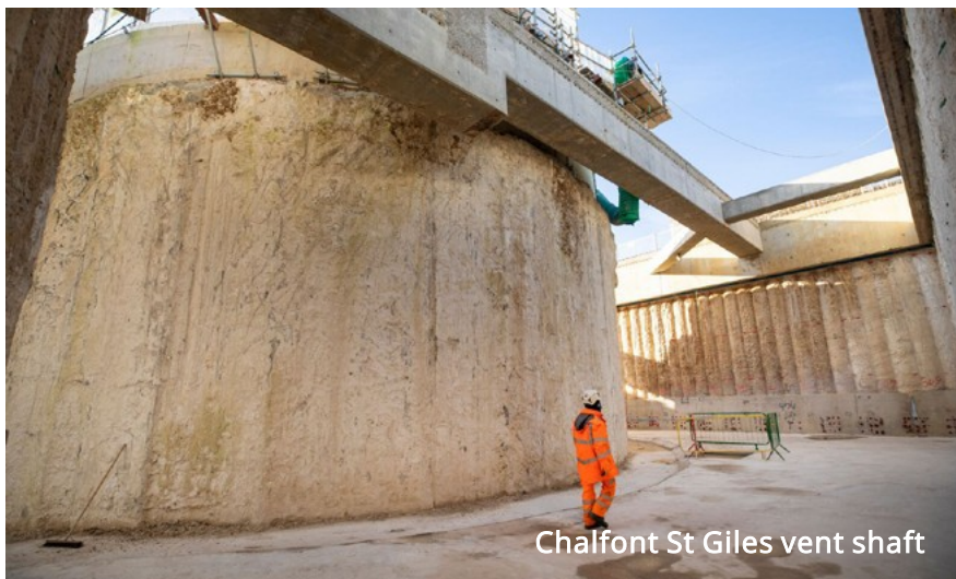
Chalfont St Giles vent shaft