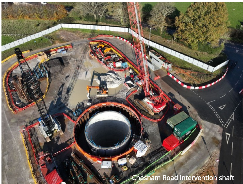
Chesham Road intervention shaft

There will be a lane closure on the B455 until mid-March 2023 as UK Power Networks work to connect the vent shaft site to the electrical network.