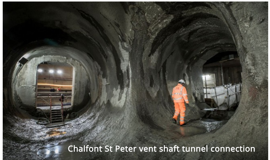
Chalfont St Peter vent shaft tunnel connection

This vent shaft (right), which is for both ventilation and emergency access for the Chiltern Tunnel, is where our construction work is most advanced. The tunnel boring machines passed through at the beginning of 2022 and we have recently just completed the connection of the base of the shaft and the tunnel.