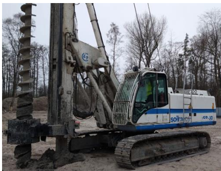
Example of the SR30 piling rig

This piling method minimises the use of vacuum-excavators, to reduce any potential noise nuisance.