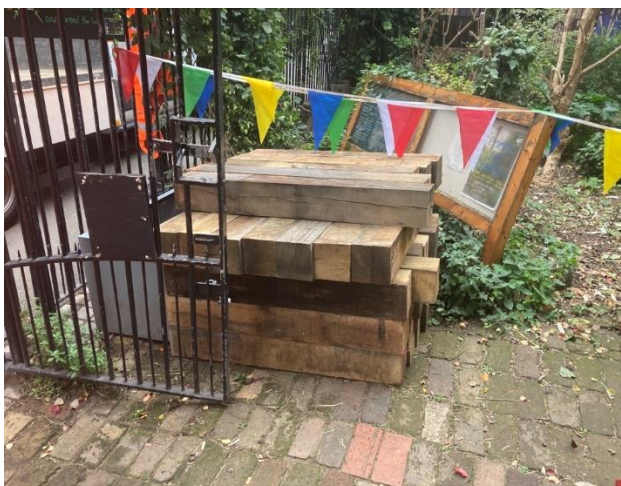
Mini sleepers donated to Phoenix Garden