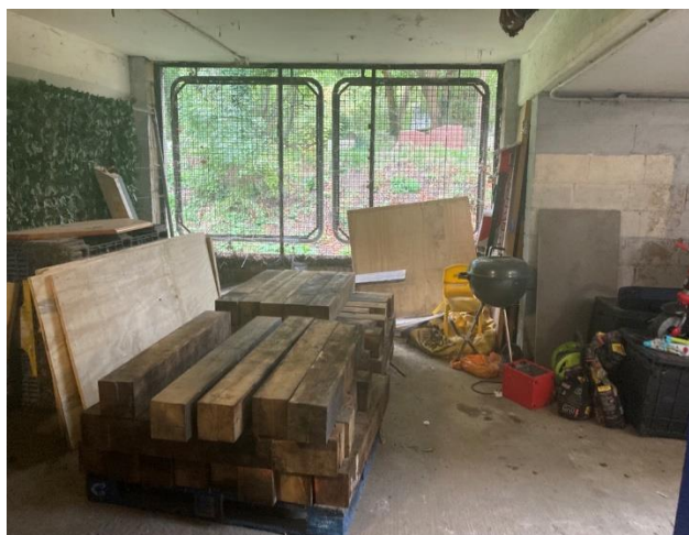
Mini sleepers donated to Woodthatworks London at Highgate Cemetery