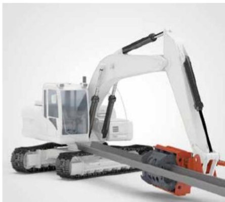
Excavator with vibratory piling hammer attachment

Please see indicative images of what the machines will look like to do these works.