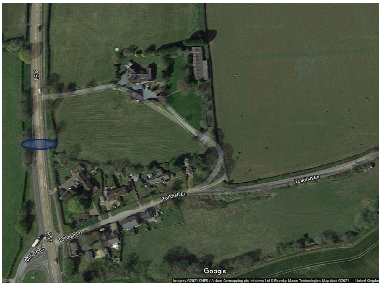
Image showing centre of works.