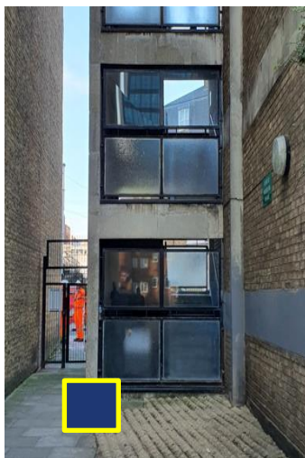
Trial hole 1