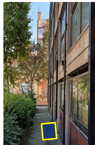
Trial hole 2