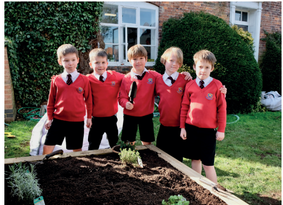
Children from Richard Crosse Primary School in Kings Bromley, completing their Growing Spaces project

The Phase 2a Community Engagement team delivered our 'Growing Spaces' initiative at schools and community centres along the line of route in March 2020. The project involved building vegetable growing boxes at each location, and teaching local young people to grow their own food. It is part of HS2 Ltd's commitment to work closely with local communities and involve them in interesting, educational opportunities. The focus of the Growing Spaces project is to teach the importance of nutrition, as well as the practical skills and the science behind growing fruit and vegetables. It reflects our commitment to respect the natural environment as we build HS2.