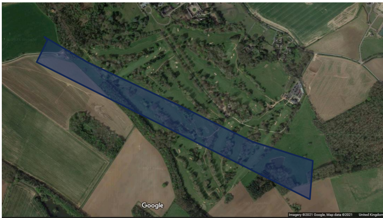
Image showing centre of works. Ecology works will continue into the surrounding fields.