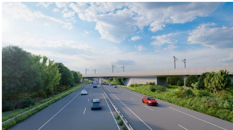
Proposed view of the M42 Marston Box structure, looking south west along the M42.

The M42 Marston Box will be moved into position during a second short-term temporary closure planned in winter 2022.