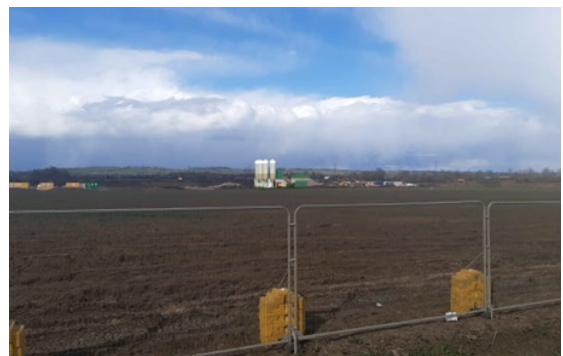
CGI images of the batching plant viewed from the A41