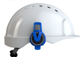
Above example of Plinx helmet