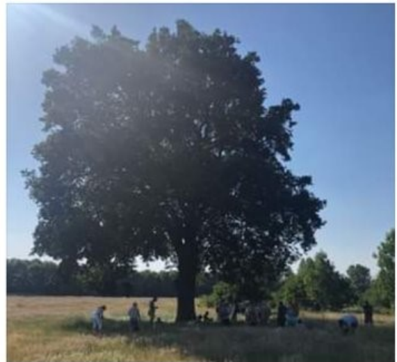
The "Earth Tree" pictured above

If you have a community project which needs support, then get in touch and speak with our engagement team to find out what funding and opportunities are available.