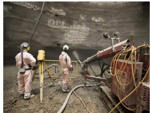
Sprayed concrete lining method

We are already in contact with those property owners who will be most affected by ground movement. If you are concerned your building could be impacted and have not heard from us, please contact HS2 Helpdesk on 08081 434 434.