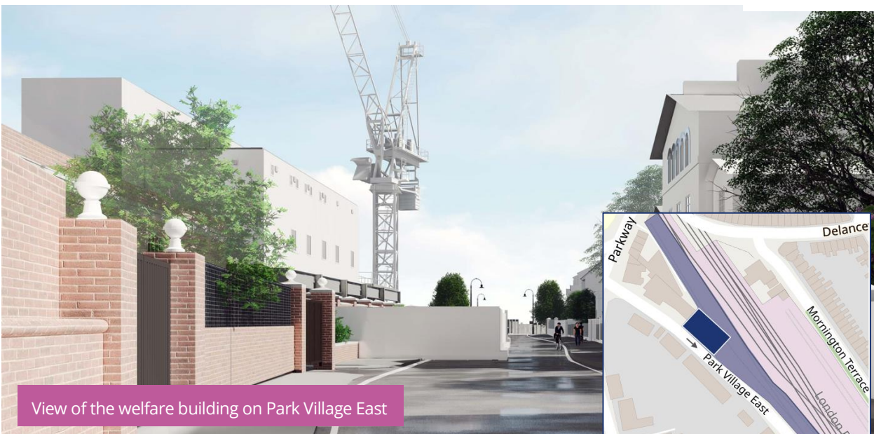
View of the welfare building on Park Village East