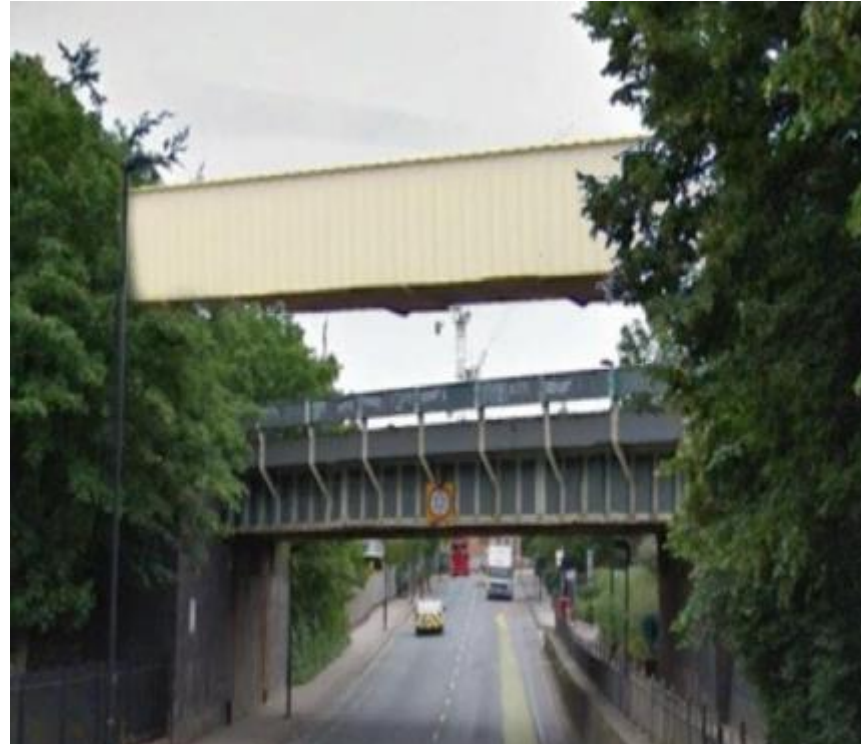
Indicative visualisation of conveyor over Victoria Road, between the Flat Iron site and Atlas Road site