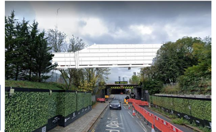
Indicative visualisation of conveyor over Old Oak Lane