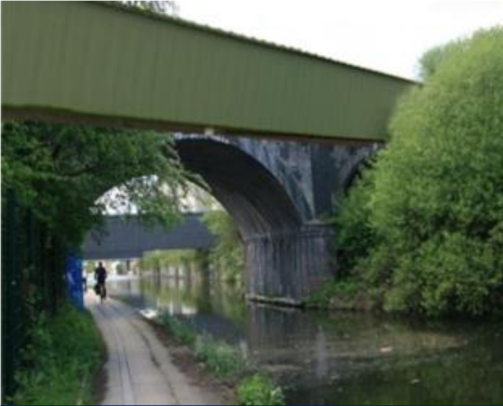
Indicative visualisation of conveyor over Grand Union Canal