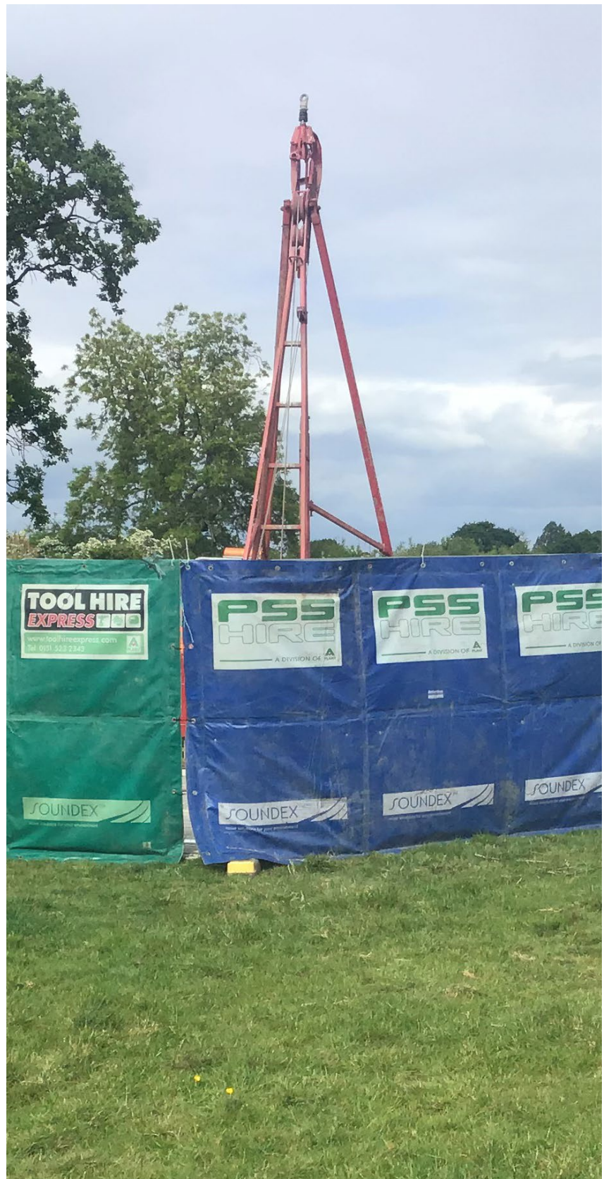
Ground investigation works on the Phase 2b Western Leg.

We'll continue to talk to individuals and stakeholders to ensure everyone is informed before work begins in their area.