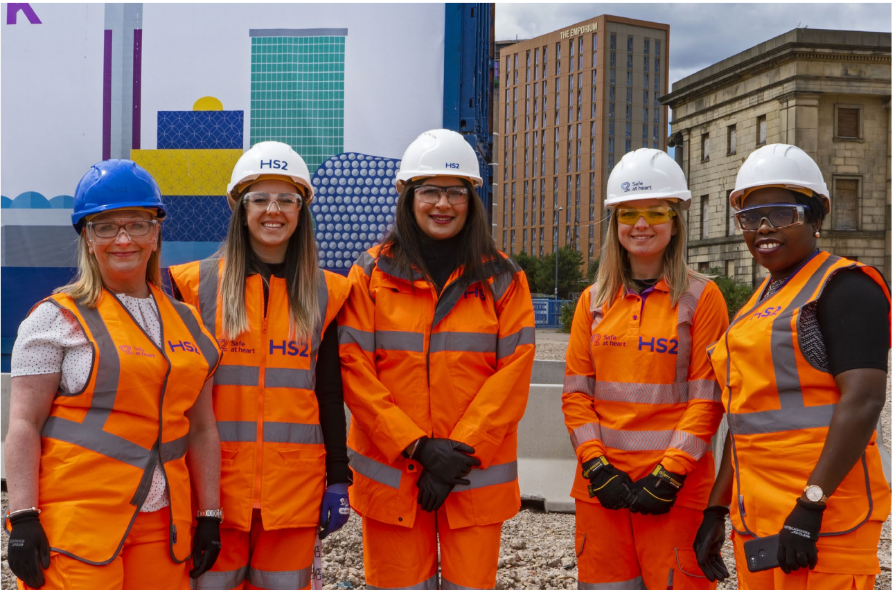
Preet Kaur Gill MP (second left) meets HS2 engineers in Birmingham.