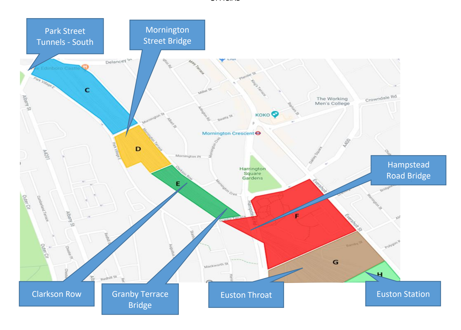
*Please note – there is no planned work for areas A, C, E, F, and G