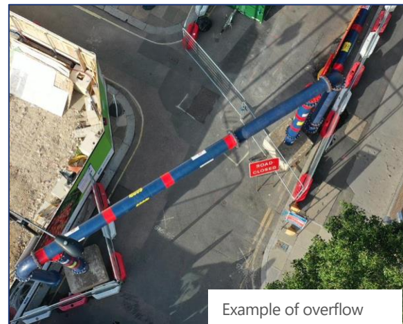
Example of overflow

Utility supplies and other services will not be affected by these works.