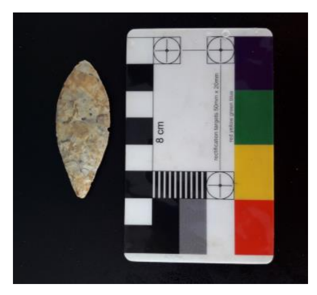
Bronze Age arrow/spear head