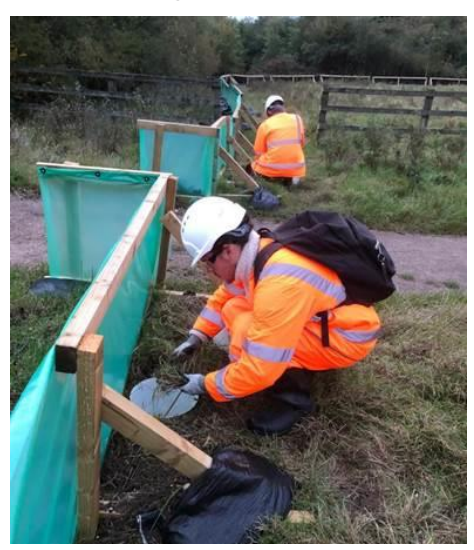
Ecologists checking for newts

When the newts move from the breeding pond, they move towards the line of the fence until they either fall into the trap or hide under a mat. All traps are checked daily by experienced ecologists who are accredited under the HS2 Great Crested Newt Licence. We will be completing the rest of this work this year.