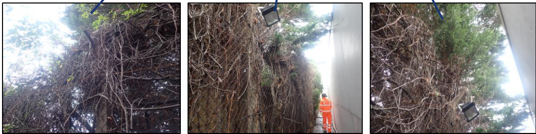
Images of vegetation to be removed