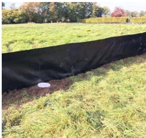
Example of newt trapping fencing

Grass and hedgerow cutting works are undertaken under the instructions of the ecologist on site, who decides the appropriate methods based on the vegetation present. This involves a detailed hand search to determine if any ecology is present. If it is found that the area is clear of ecology then the works will be allowed to take place. A small workforce will use machinery and hand-held equipment to cut sections of grass and hedgerows. Grass will be cut down to 15 centimetres above ground. Hedges will only be removed if required for the access route around the site.