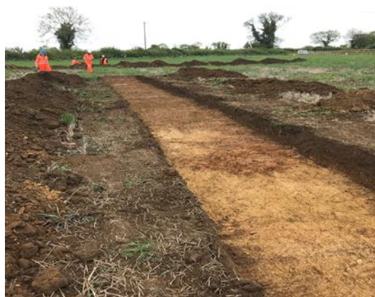
Example of trial trenching

If any archaeology of significance has been identified, larger areas will be stripped to open up the archaeology initially through trial trenching and then depending upon the result further mitigation work will be undertaken. This will allow the archaeological teams to create a more complete picture of the findings.