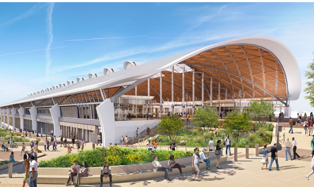
Side view of the western entrance of the station and Station Square