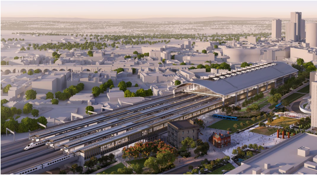
View of the new station from Curzon Promenade