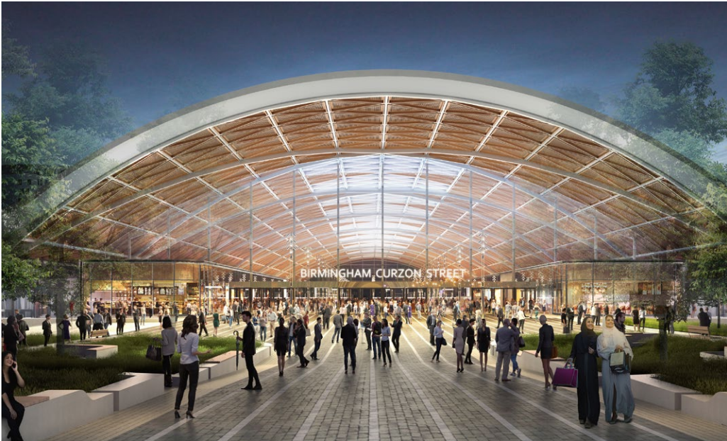
Front view of the western entrance of the new Curzon Street Station and Station Square